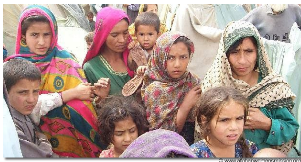
Photo from Jalozai Refugee Camp Exhibit

Women, War, and Afghanistan. The Women’s Center developed a day-long mini-symposium to discuss gender issues in the wake of 9/11. The focus of the discussion included an exploration of issues of women and war and current issues for Afghan women. The events included a photo exhibit of Jalozai Refugee Camp (“View from a Grain of Sand: Lives of Afghan Refugees”) from the Afghan Women’s