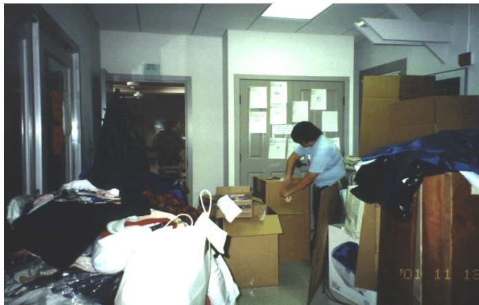
Packing up the many boxes of donated items for Dress for Success