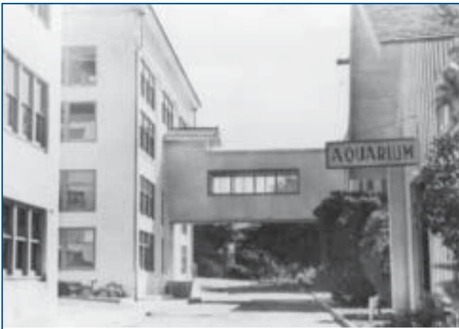
Figure 1. In 1916, the first aquarium building was constructed.