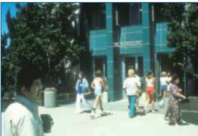
Figure 3. For the first time, the aquarium and museum were under one roof with the construction of the T. Wayland Vaughan Aquarium-Museum.