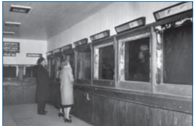
Figure 2. Funds to maintain the aquarium were often sparse and resulted in what has been described as "benign neglect," as is clearly evident in this photo.