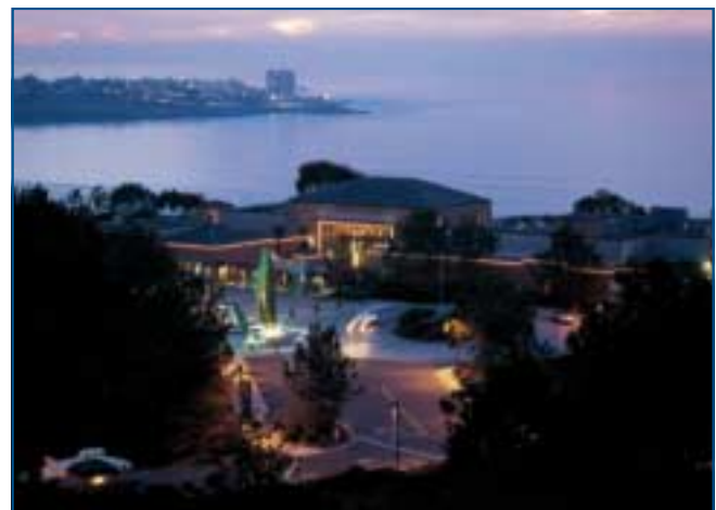
Figure 4. The opening of the Stephen Birch Aquarium-Museum in 1992 enabled Scripps to achieve for the first time the vision of its first director William E. Ritter, who saw the aquarium and museum as being "essential and integral elements in our plan for public education."

kelp forest exhibit and an outdoor tide pool on the Preuss Plaza.