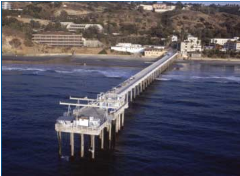
Scripps campus as seen from the Ellen Browning Scripps Memorial Pier in the mid-1990s.

atmospheric greenhouse gases to the highest concentrations in the past half-million years. This will cause a warming of the global climate throughout the present century. The sea level will rise, and there will be unknown effects on the fresh water cycle, the distributions of plants and animals, and the propagation of human disease. The time scale for many of the changes being wrought by man is tens of years—one which strains the capacity of human institutions to adapt.