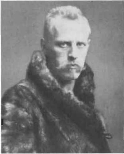
Figure 3. Fridtjof Nansen.