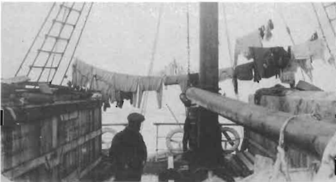
Figure 16. On the Maud : monotony in the arctic.