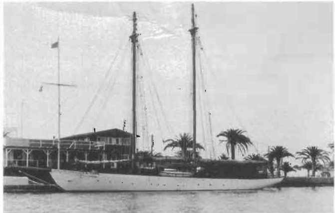
Figure 31. The Serena , soon to become the E. W. Scripps .