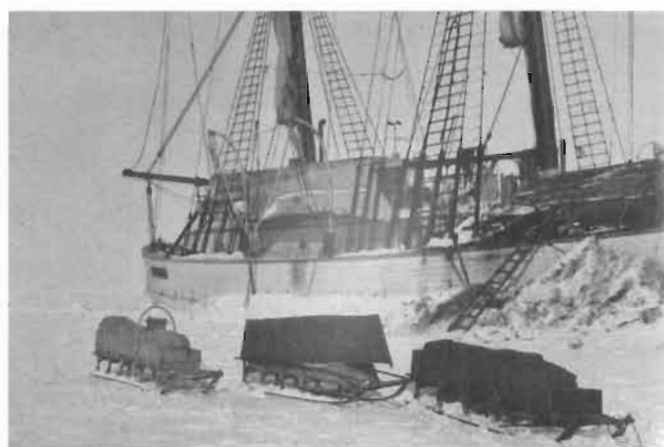
Figure 14. Maud and provisions for emergency escape.