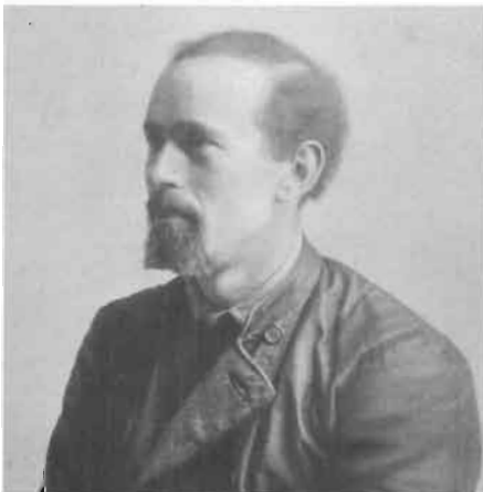
Figure 9. Sverdrup, about 1919.

Summer of 1921: the explorers discovered that the Maud's propeller had broken. Now, they had to sail to Seattle for repairs. Through the stormy north Pacific, Sverdrup showed great skill and courage as he helped the vastly understaffed crew navigate southward. Back in civilization, Sverdrup learned about the revolution in meteorology that Bjerknes and his young assistants had effected during the past three years. When Bjerknes moved to Bergen in 1917 and later considered establishing an experimental weather forecasting service, he had hoped that Sverdrup could lead this endeavor. In his place others paved the way and in so doing used the opportunities to overhaul meteorology. Sverdrup was filled with regret. Greatly agitated, he admitted that had he had an inkling as to what was to happen on the expedition, he would never have joined. 11 But he might as well try making the best of the situation. While waiting for repairs during the winter, Sverdrup arranged to stay in Washington, D.C. at the Carnegie Institution's Department of Terrestrial Magnetism. Here he analyzed the preliminary magnetic observations, borrowed considerably better instruments, and established a rapport with the staff that would later prove significant for many cooperative ventures.