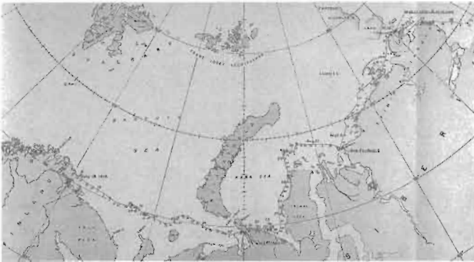
Figure 6. The Maud expedition's progress, 1918-1920.

was compounded by a series of accidents that befell Captain Amundsen. First, one of the expedition's large dogs knocked him overboard onto the ice, resulting in a badly broken arm; then while investigating some strange sounds on the ice in a dense fog he encountered a polar bear and in the ensuing race received a swipe from the bear's paw which knocked him down and removed a bit of his buttocks (Fig. 8). Sometime later, he suffered a heart attack. All in all, it was not a good start for a long expedition.