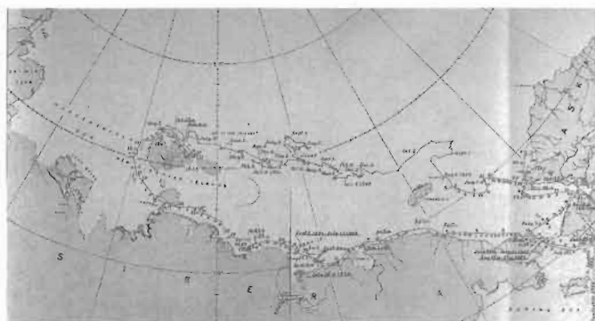
Figure 15. The drift of the Maud , 1921- 1925.