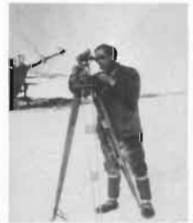
Figure 7. Sverdrup adjusting a theodolite, 1919.

In the summer the ice scarcely broke along the coast. The scientists used explosives to continue pressing eastward, but reached only as far as Ayon Island before the winter set in. Here they encountered a