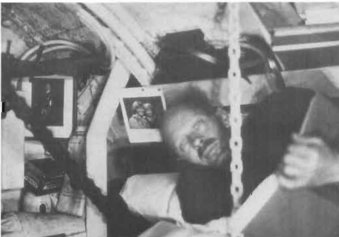
Figure 21. Sverdrup's living quarters on the Nautilus .