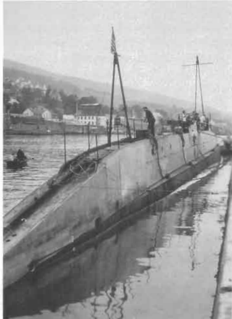
Figure 19. The Nautilus in Bergen.

Well, how would this adventure turn out? 29 Mechanical problems on the trip from Brooklyn to Norway resulted in delays and worries. Sverdrup waited restlessly in Bergen. July: still no Nautilus . Finally, Wilkins and the Nautilus arrived in Bergen (Fig. 19).