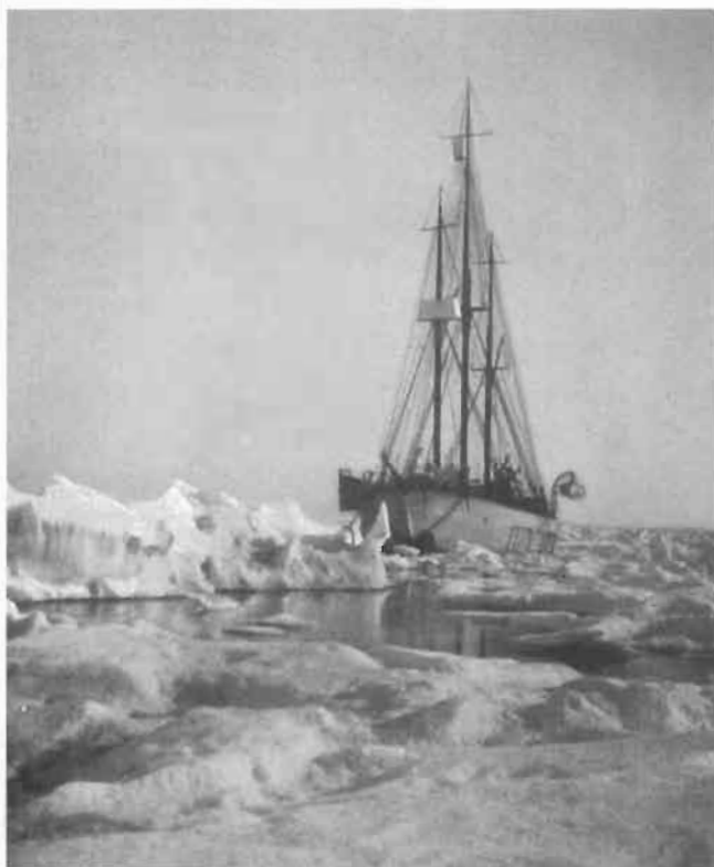
Figure 5. The Maud navigating ice fields.

Amundsen (Fig. 4) planned to sail the Maud through the northeast passage and enter the pack-ice north of the Bering Strait before winter. During the ensuing three years the Maud was to be a floating laboratory collecting measurements of terrestrial magnetism, atmospheric electricity, weather conditions near the surface and aloft, oceanic conditions, northern lights, and virtually anything else that might be of scientific and cultural interest. The crew of nine shared the daily practical duties and most attempted to assist in the scientific program. As the Maud proceeded eastward along the Siberian coast they discovered that the ice floes were much more extensive than previously encountered by explorers (Figs. 5, 6). By early September they were locked in the coastal ice near Cape Chelyuskin. They spent the winter making improvements on the ship and on their scientific equipment (Fig. 7). The initial disappointment of getting delayed for at least one year