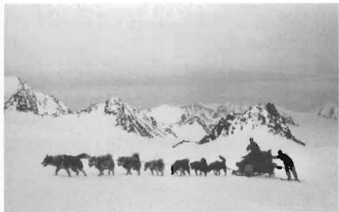
Figure 26. Spitsbergen 1934: Sverdrup in his element.

And once again extraordinary discipline permitted them to obtain exceedingly valuable data. Every hour was accounted for; they collected over 20,000 observations (Figs. 27, 28, 29). Although the sun never set, the temperature often hovered at freezing while dense fog swirled around them for days on end (Fig. 30). They experienced only one major mishap. On the way down from the glacier the ice had developed a glass-like consistency; the dogs sliced open their paws, leaving a trail of blood behind them. Some had to be put out of their misery; others were saved by placing them on top of the equipment while the men negotiated the sledge down to the coast.