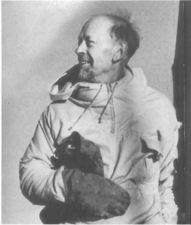
Figure 36. Sverdrup in the antarctic, 1951.

In 1948 Sverdrup returned home to lead the Norwegian Polar Institute and to take over the planning of the Norwegian-Swedish-British Antarctic Expedition (Fig. 36). Although missing much of the excitement at Scripps and following closely the ever-changing political and personnel situation — he supported Revelle as director of Scripps 81 — he also expressed a joy of ending his twelve-year longing for a Norwegian spring.