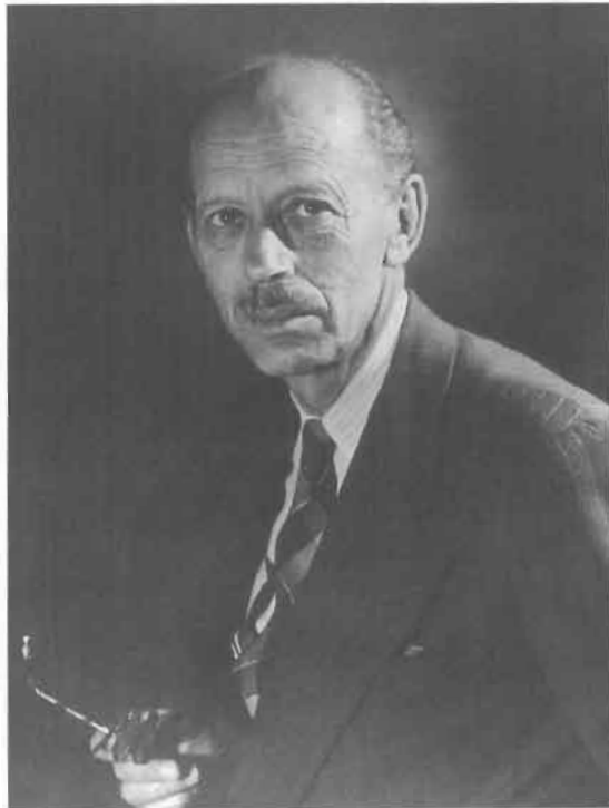
Figure 35. Sverdrup: leader of postwar oceanography.

We must change scenes: the Soviet Union. Immediately following victory in Europe, Sverdrup's friend Ahlmann attended a celebration at the Russian Academy of Science. He became alarmed over the extraordinary measures being taken to step up polar research, exploration, and colonialism. He also knew that during the war the Americans had dramatically increased their engagement in the arctic. Ahlmann feared for the Nordic nations; he especially feared for Norway's vital interests in the arctic and antarctic. Territorial claims were still disputed; only vigorous activity could legitimize these claims. In discussions with Prime Minister Gerhardsen and more extensively with cabinet ministers Trygve Lie, Lars Evensen, and especially Halvard Lange, as well as with key members of parliament, Ahlmann advocated establishing a major institution to oversee research, surveying, and commercial activity in the polar regions. And such an institution must be led by an internationally respected scientist: Harald Ulrik Sverdrup (Fig. 35). 80