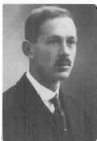
Figure 2. Sverdrup in 1916.

Sverdrup was off to a bright start in research. He was also astute enough to be assessing the question that most doctoral students ask: what on earth am I going to do when I'm finished? No job was waiting for him. When approached by Roald Amundsen to join his much-delayed expedition as scientific leader, Sverdrup responded affirmatively. Now, why would a most promising young scientist agree to spend what was projected to be four or more years drifting in the arctic ice? We might speculate. But to family friends who opposed his plans he wrote the following (Fig. 2):