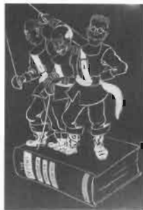
Figure 33. "Four pounds and all muscle."