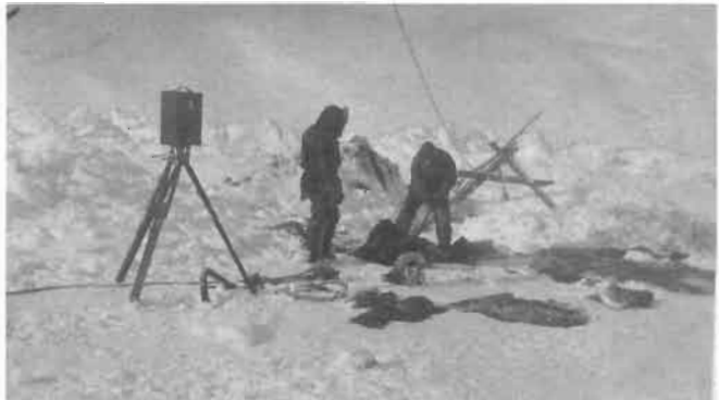
Figure 10. The hunt for fresh meat: walrus.

Based on a strict regime of discipline and innovative instrumental practices, Sverdrup set up a comprehensive geophysical observatory on the drifting ice. He overcame the seemingly insurmountable difficulties of making reliable precision measurements in a most hostile environment. Frost instantly formed on the eye-pieces of measuring instruments while needles had an unfortunate tendency to freeze in place; sounding balloons had to be made visible in the weeks of perpetual darkness; means had to be devised for launching instrument-carrying kites and then bringing them down from several thousand feet in stiff breezes at sub-zero temperatures; holes in the ice for