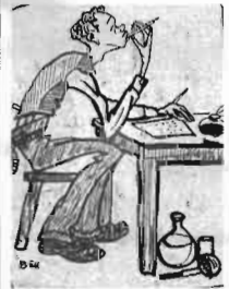
Figure 25. Thinking polar dreams?

Laboratory and theoretical studies provided some clues; Sverdrup wanted direct measurements. Although he began devising instruments for making measurements at the ocean surface, he recognized that a better approach entailed first studying in excruciating detail the heat budget above and below a layer of smooth snow. Sverdrup and his Swedish friend, glaciologist Hans W:son Ahlmann, proposed spending a summer camped on top of a glacier high in the mountains of Spitsbergen, where conditions should be ideal for a number of experiments. In an otherwise bleak time for obtaining funds, they capitalized on Norwegian arctic territorial disputes. Legitimizing territorial claims came through maintaining an active presence, such as through scientific work, surveying, and commercial activities. Through the assistance of Prime Minister Johan Ludwig Mowinckel, they received a relatively substantial grant through the Ministry of Commerce, which had jurisdiction over Svalbard matters. 33