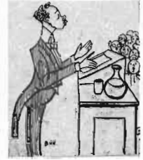
Figure 17. Professor Harald Ulrik Sverdrup in Bergen.