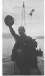
Figure 20. Off to arctic adventure!

Once the Nautilus entered the waters north of Spitsbergen, Sverdrup began a successful program of making observations from a pressurized diving chamber. They reached 82 degrees north and climbed onto the ice for water, air, and magnetic observations (Figs. 22, 23). Then, finally, Wilkins gave the signal to submerge under the ice. But, the diving rudder didn't respond. Into a diving suit and into the freezing water, a crew member investigated. What he found did not make Wilkins happy. The diving rudder had disappeared. Either it had fallen off or had been sabotaged by one of the crew. In despair Wilkins decided to submerge the front of the boat under the ice to test equipment as well as to make the first under-ice photographs and light