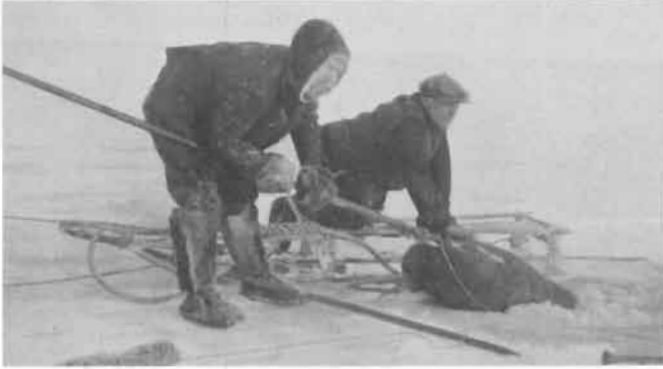
Figure 11. The hunt for fresh meat: seal.

oceanographic instruments had to be re-cut every several hours (Fig. 12).