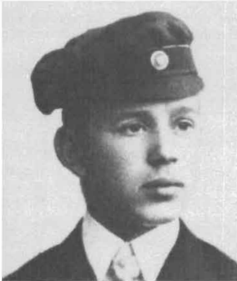
Figure 1. Harald Ulrik Sverdrup, 1906.

Bjerknes' lectures prompted Sverdrup to abandon astronomy for geophysical science. In 1912 he began his first expedition, of sorts—that toward becoming a researcher and, more geographically, moving to the University of Leipzig, where Bjerknes had been called to direct a new geophysical institution. Sverdrup followed as a research assistant and doctoral student. He joined Bjerknes' massive project by working on the dynamics of geophysical motions, and in particular by factoring in the effects of friction, turbulence, and energy balance. He authored or coauthored 20 articles during his five years in Leipzig. His doctoral dissertation, completed in 1917, on the structure, dynamics, and thermodynamics of the north Atlantic trade wind became a classic. Sverdrup's studies with Bjerknes provided a general set of