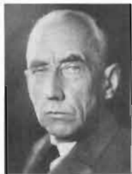
Figure 4. Roald Amundsen.

Amundsen (Fig. 4) planned to sail the Maud through the northeast passage and enter the pack-ice north of the Bering Strait before winter. During the ensuing three years the Maud was to be a floating laboratory collecting measurements of terrestrial magnetism, atmospheric electricity, weather conditions near the surface and aloft, oceanic conditions, northern lights, and virtually anything else that might be of scientific and cultural interest. The crew of nine shared the daily practical duties and most attempted to assist in the scientific program. As the Maud proceeded eastward along the Siberian coast they discovered that the ice floes were much more extensive than previously encountered by explorers (Figs. 5, 6). By early September they were locked in the coastal ice near Cape Chelyuskin. They spent the winter making improvements on the ship and on their scientific equipment (Fig. 7). The initial disappointment of getting delayed for at least one year