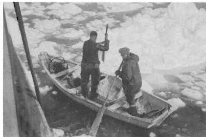
Figure 13. In search of drifting dogs and instruments.