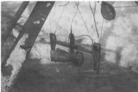
Figure 12. An Ekman current meter fitted for arctic duty.

But what of their drift across the polar sea (Fig. 15)? In September 1923 they were buoyed by the prospect of crossing on a path north of Nansen's, but