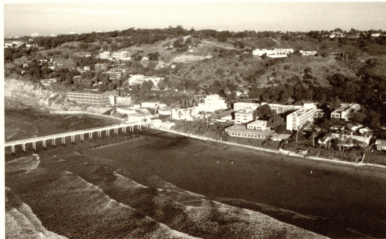
Scripps Campus Today

Scripps Institution of Oceanography: scripps.ucsd.edu Birch Aquarium at Scripps: aquarium.ucsd.edu