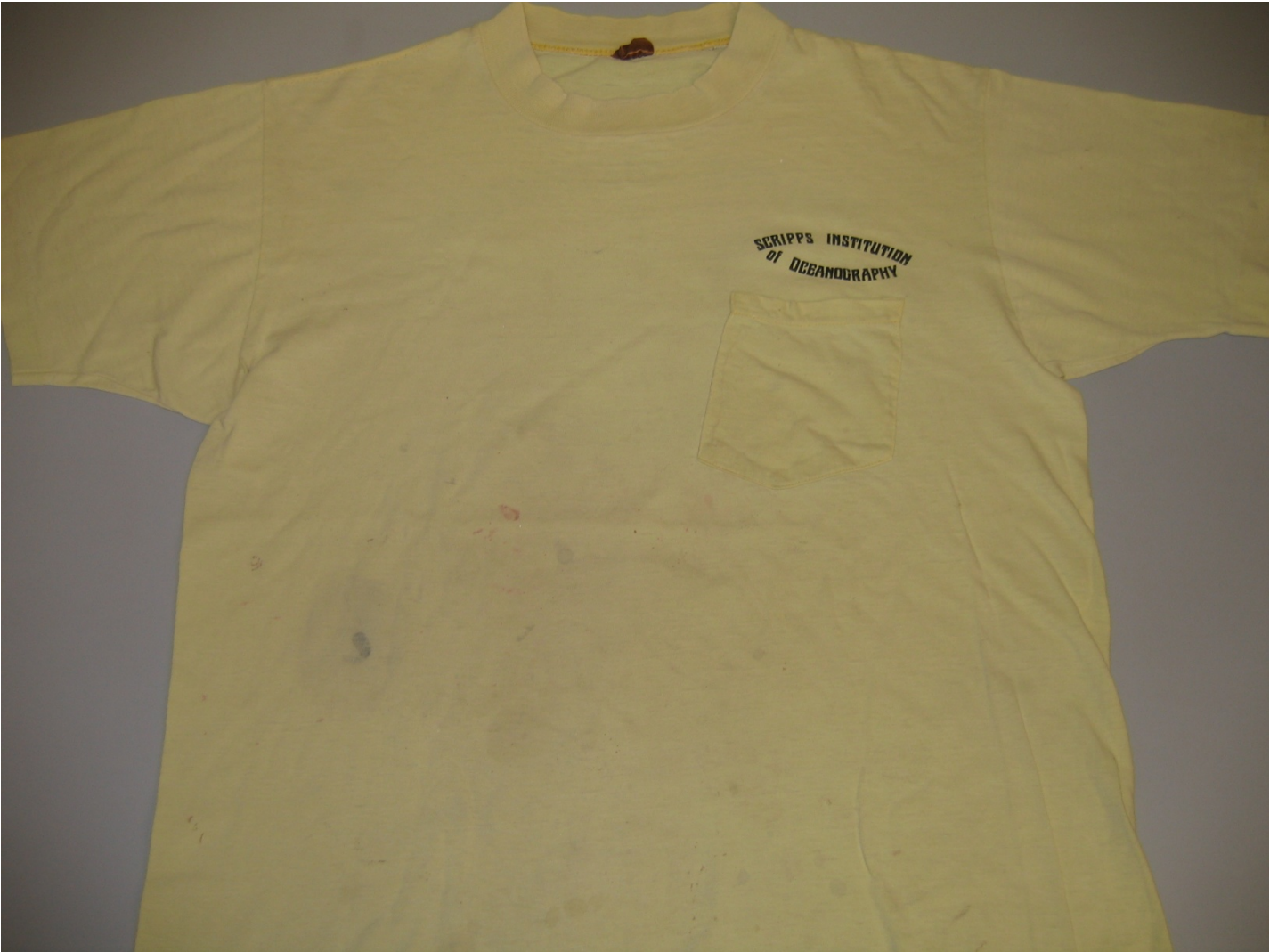
Front of tee shirt