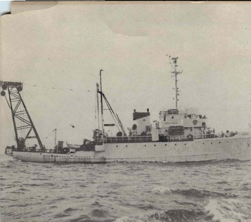
The "Spencer F. Baird" is one of the five ocean-going ships of the Institution's research fleet. The "Baird" has been specially fitted out for deep-sea research.