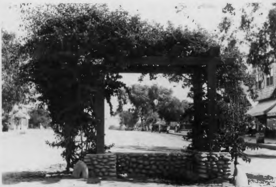
Copy of old postal card - Water Trough on main street. Peck's Drug Store to right of picture. Part of name was cut off when copying. About 1915 or 1916