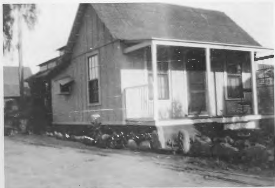
The Michiquito on Waverly Lane 1915