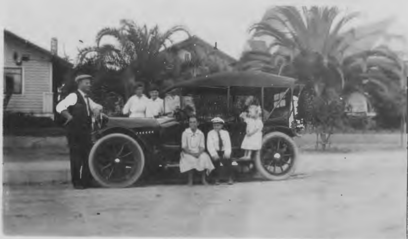
Seymour Home on Ivanhoe - 1916