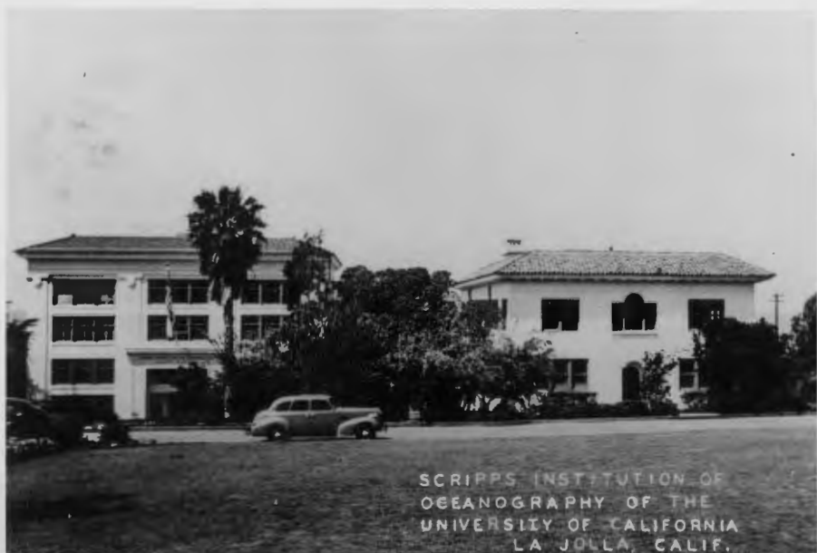
SCRIPPS INSTITUTION OF OCEANOGRAPHY OF THE UNIVERSITY OF CALIFORNIA LA JOLLA, CALIF.