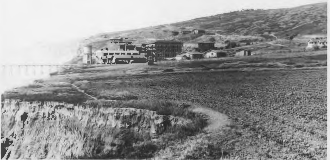
Biological Station about 1916