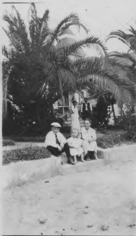
Seymour Home on Ivanhoe Ave. 1916