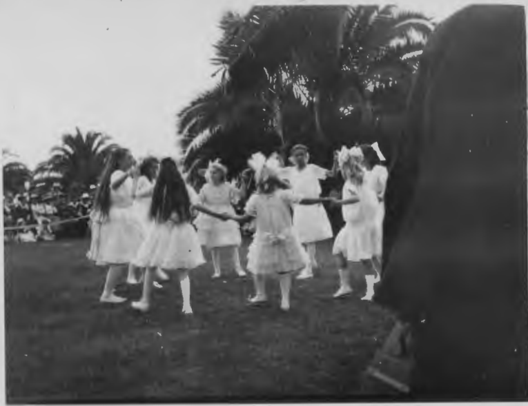
May Festival-La Jolla Playgrounds May 1, 1918