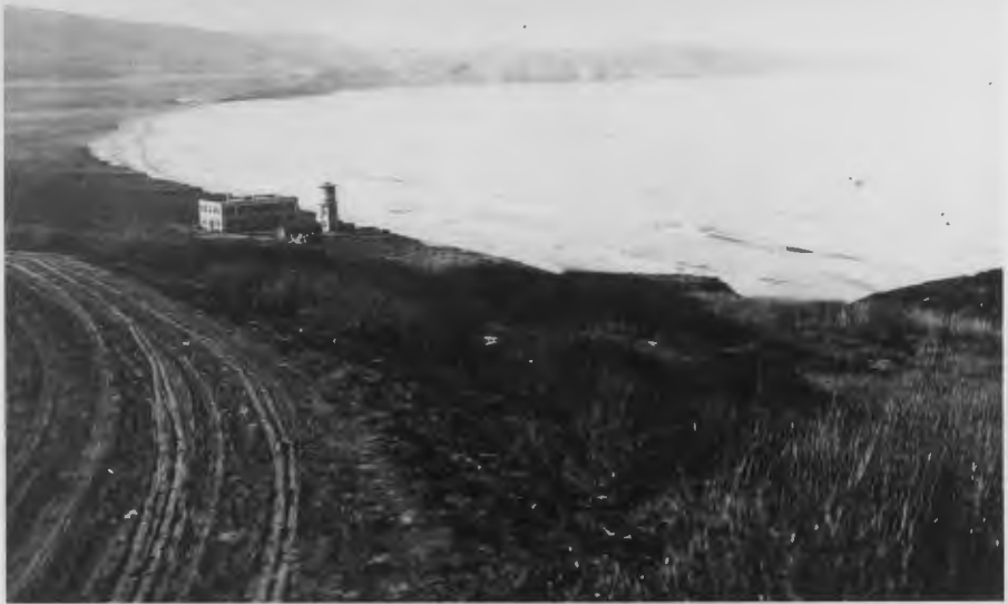
Beginning of the Biological Station & main highway between San Diego & Los Angeles. Three miles unpaved for many years.