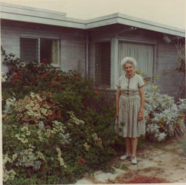
Mrs. Peggy Fleming