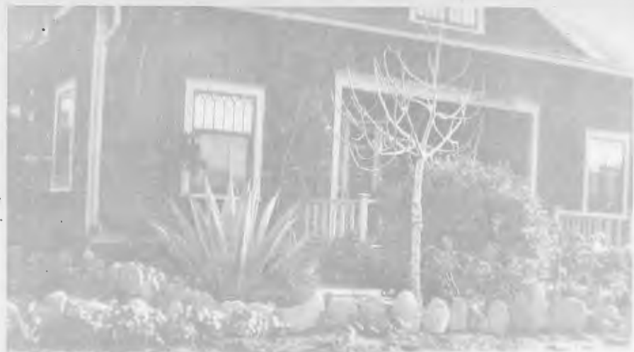
The Waverly- 1915