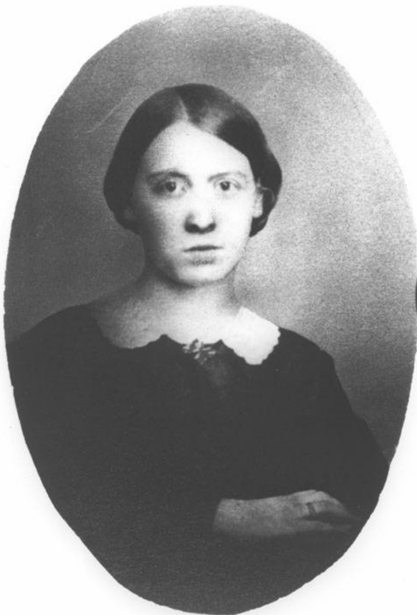
Ellen Browning Scripps, circa 1868

Ellen Browning Scripps was born in London October 18, 1836, the daughter of an improvident bookbinder from an otherwise distinguished family of printers and intellectuals. Her father was twice widowed in England and emigrated with his six surviving children to Rushville, Illinois in 1844 where he established a farm. He married again and had five additional children. Miss Scripps' eldest brother was James Edmund Scripps (1835-1906) and the youngest child of the family was her favorite, Edward Wyllis Scripps (1856-1926).