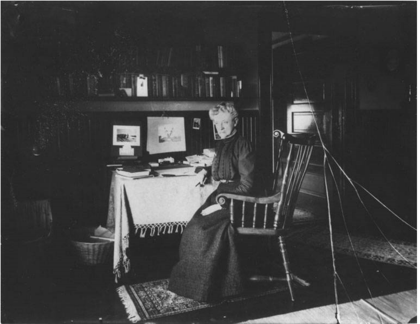
Ellen Browning Scripps, 1904

Miss Scripps's principles were straightforward. She believed in education and free speech, she was an advocate of women's suffrage and women's clubs, biology interested her, she abhorred discrimination and privilege, she favored temperance and world peace. She disliked the word "philanthropist," and referred to her gifts as investments.