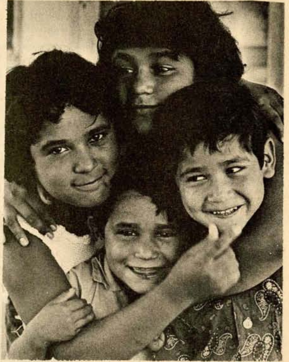
We play.....