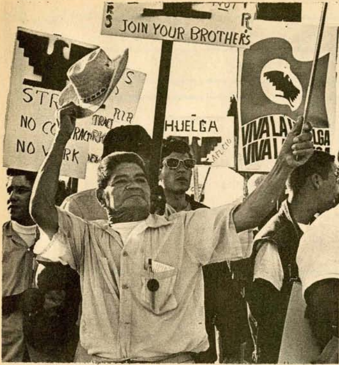
We picket.....