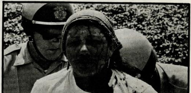
In 1973, two UFW strikers were killed, hundreds were beaten, and 4000 picketing farmworkers were arrested during strikes at California lettuce fields.

There is good reason to question whether the Teamster officials are at all concerned about defending the interests of the farmworkers, considering the close ties they have established with the Nixon administration. Richard Nixon has long been an opponent of farmworker organizing efforts. In 1950, he helped author a Congressional study which declared that farmworkers should be excluded from national labor relations