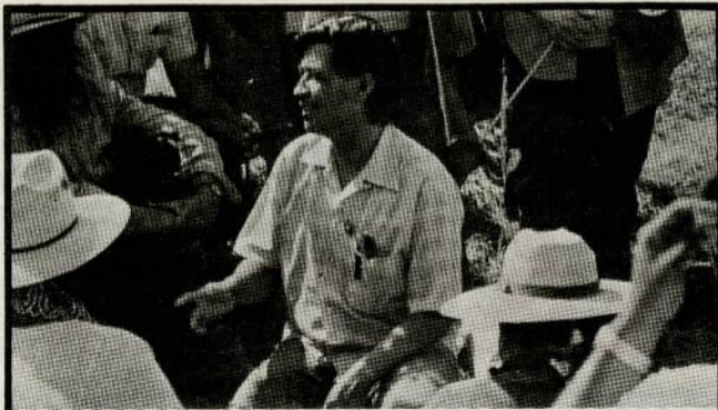
Cesar Chavez, President of the United Farm Workers, speaking to a group of workers.

brutal working conditions and meager wages that are the lot of the migrant farmworker. In California, the center of the nation's fruit and vegetable industry, a team of lawyers found that as many as 83% of the farms were in violation of state laws requiring sanitary toilets for employees. More than 88% did not even provide safe drinking water. 4 In addition, farmworkers are regularly exposed to massive amounts of lethal pesticides, such as Phosdrin, a chemical based on a nerve gas developed in World War II. A study conducted by the state of California found that 80% of the workers tested suffered at least one symptom of pesticide poisoning ( Fresno Bee 9/29/69).