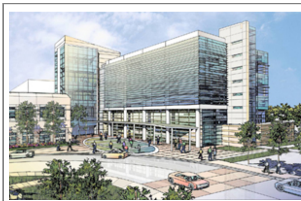
schematic drawing of new Sulpizio Family Cardiovascular Center

O n September 27, 2007, UC San Diego Medical Center will break ground for the Sulpizio Family Cardiovascular Center, a new 128,000-square-foot facility that includes an expansion of patient care areas of UCSD's Thornton Hospital. The sparkling four-story project will unify UCSD's ambulatory, clinical, and inpatient heart and stroke care in one convenient location with construction completion expected in 2010.