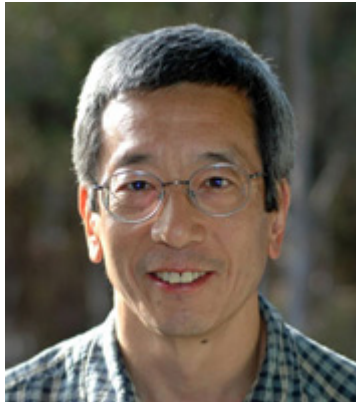
Roger Tsien, PhD

Building on his Nobel Prize-winning work creating fluorescent proteins that light up the inner workings of cells, a team of researchers led by Howard Hughes Medical Institute investigator Roger Tsien, PhD, professor of pharmacology, chemistry and biochemistry at the University of California, San Diego and the