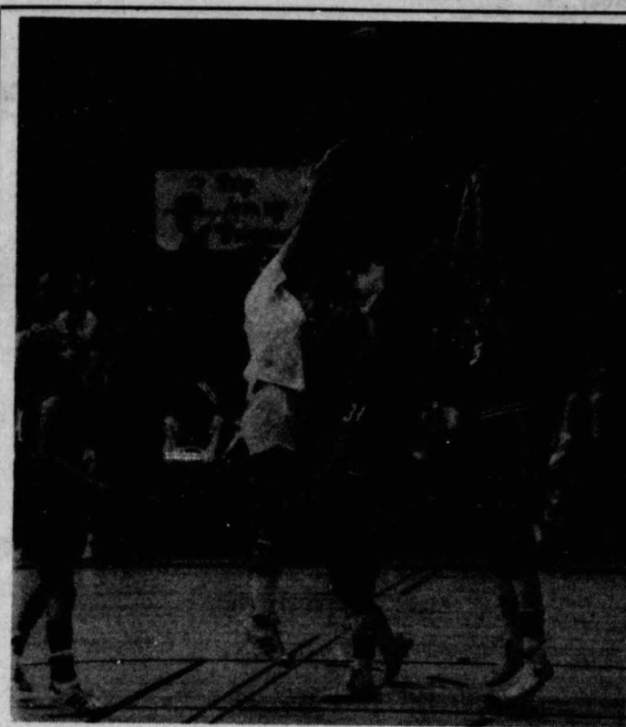
The women's basketball team will don its white home uniforms to host Cal Lutheran Friday at 5 pm.

Men's JV Basketball vs. Mira Costa Home 5pm Men's Varsity Basketball vs. Southern Cal College Home 7:30 pm Women's Basketball vs. Azusa Pacific Away 7:30 pm