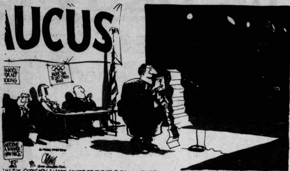
"IN THE CATEGORY, 'MOST ADEPT OF EITHER PARTY AT SELF PROMOTION WHILE NEVER CALLING OUR SORRY PRESIDENT WEAK OR MENTIONING HOSTAGES, CHAPPAQUIDDIC, ANOTHER CANDIDATE'S AGE OR OBSCURITY, MILK MONEY OR LINDA RONSTADT (EXCEPT BY UNFORTUNATE ACCIDENT)', THE WINNER IS..."