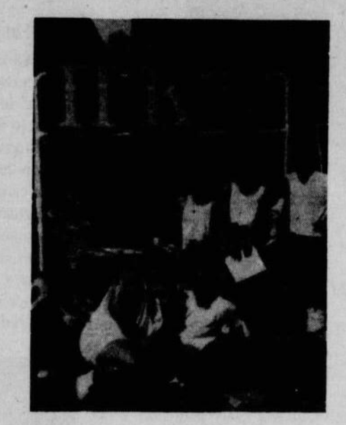
Brothers of Pi Kappa Phi invite pledges to join UCSD's first dry rush.

Are you interested in seeing how your professors live? In what happened to former students who graduated from UCSD? In a free, home cooked meal? Join other students, alumni, staff and faculty by signing up for GUESS WHO'S COMING TO DINNER? on Sunday, May 7th. UCSD Alumni and faculty members will be hosting a number of simultaneous dinners on that evening. Approximately 6 students will be invited to each dinner. Sign-up sheets for those students who would like to attend a dinner will be at MOM, EDNA, the Revelle Commuter Lounges, the College Deans' offices and the Resident Deans' offices. The sign-up deadline is April 11th. Sign up and bring a friend! If you need additional information, call the Alumni Office at 684-8900.