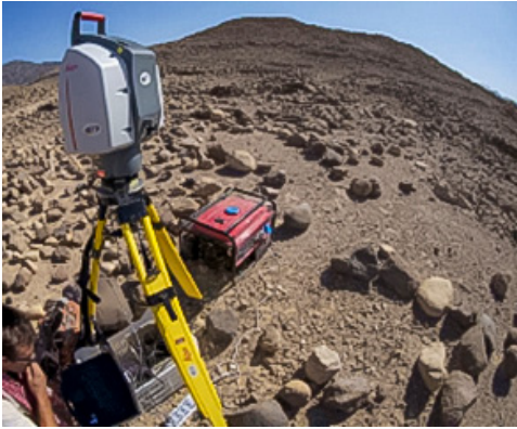
LiDAR laser scanner at Khirbat Faynan, where the expedition collected billions of geo-referenced data which to create 3D maps and computer models of the site.