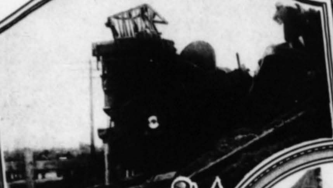
Train plunges through bridge weakened by heavy rains. Several killed and many injured.