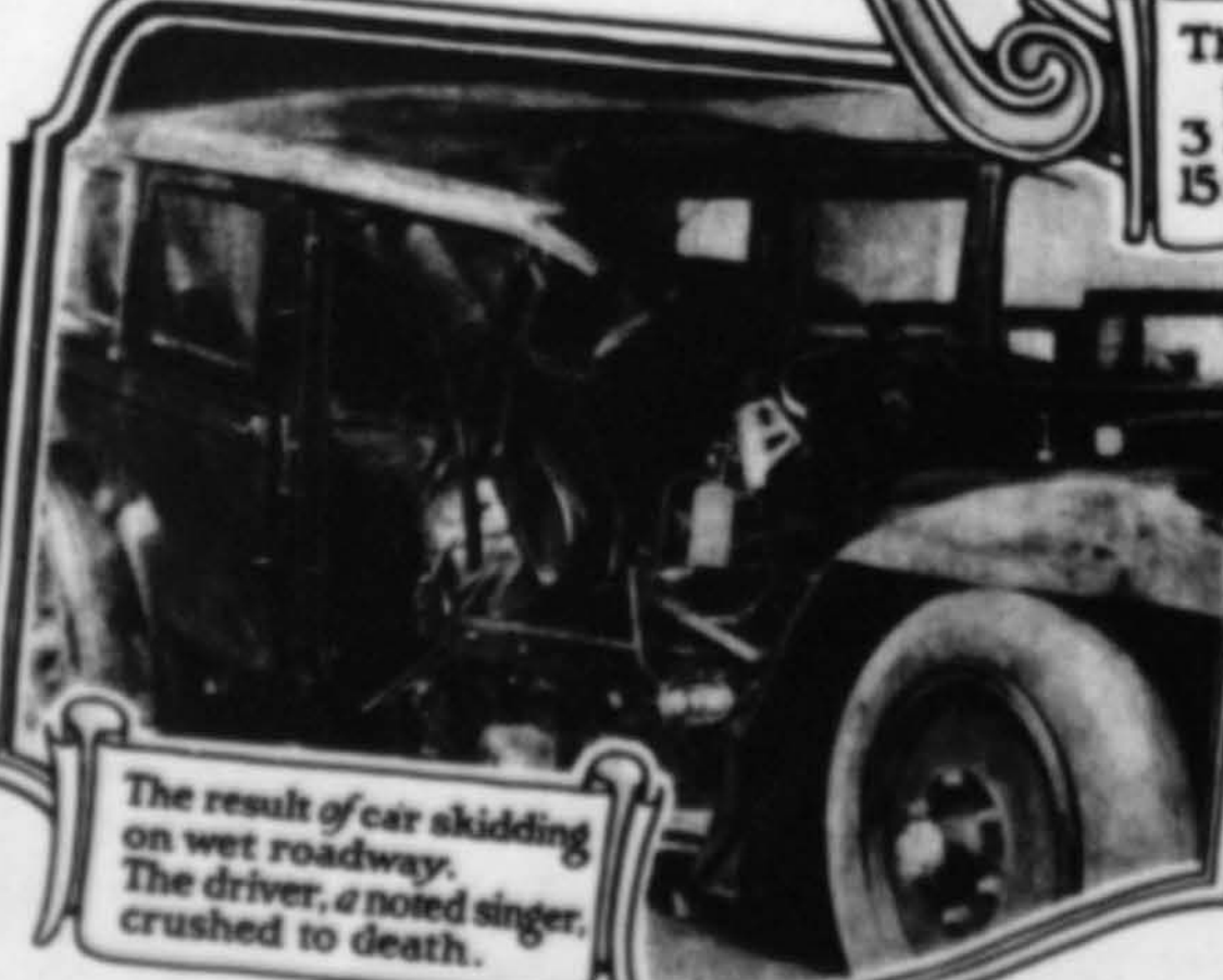
The result of car skidding on wet roadway. The driver, a noted singer, crushed to death.