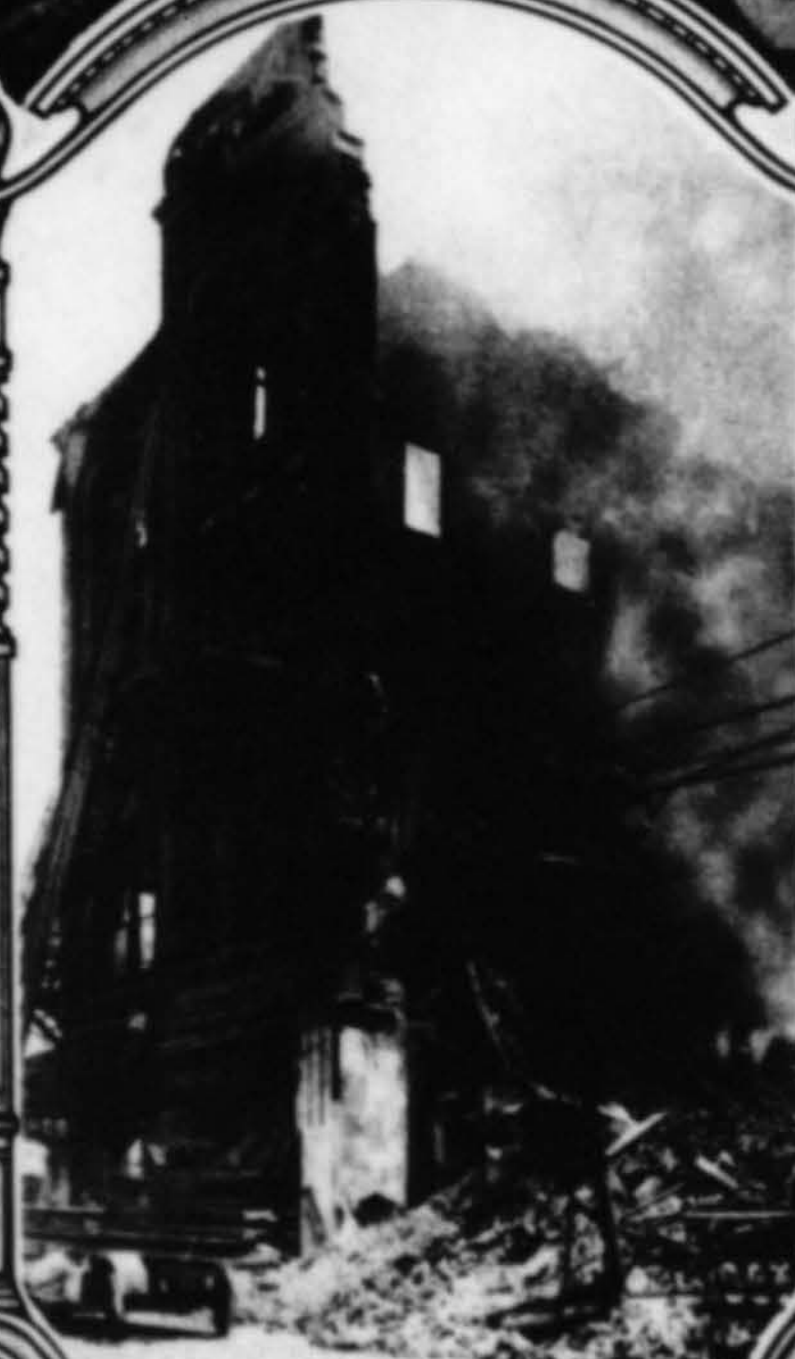
Theatre fire. 3 killed, 15 injured.