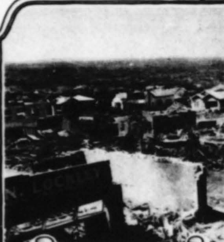
When stormy winds blow. 56 killed and 150 injured in Texas tornado.