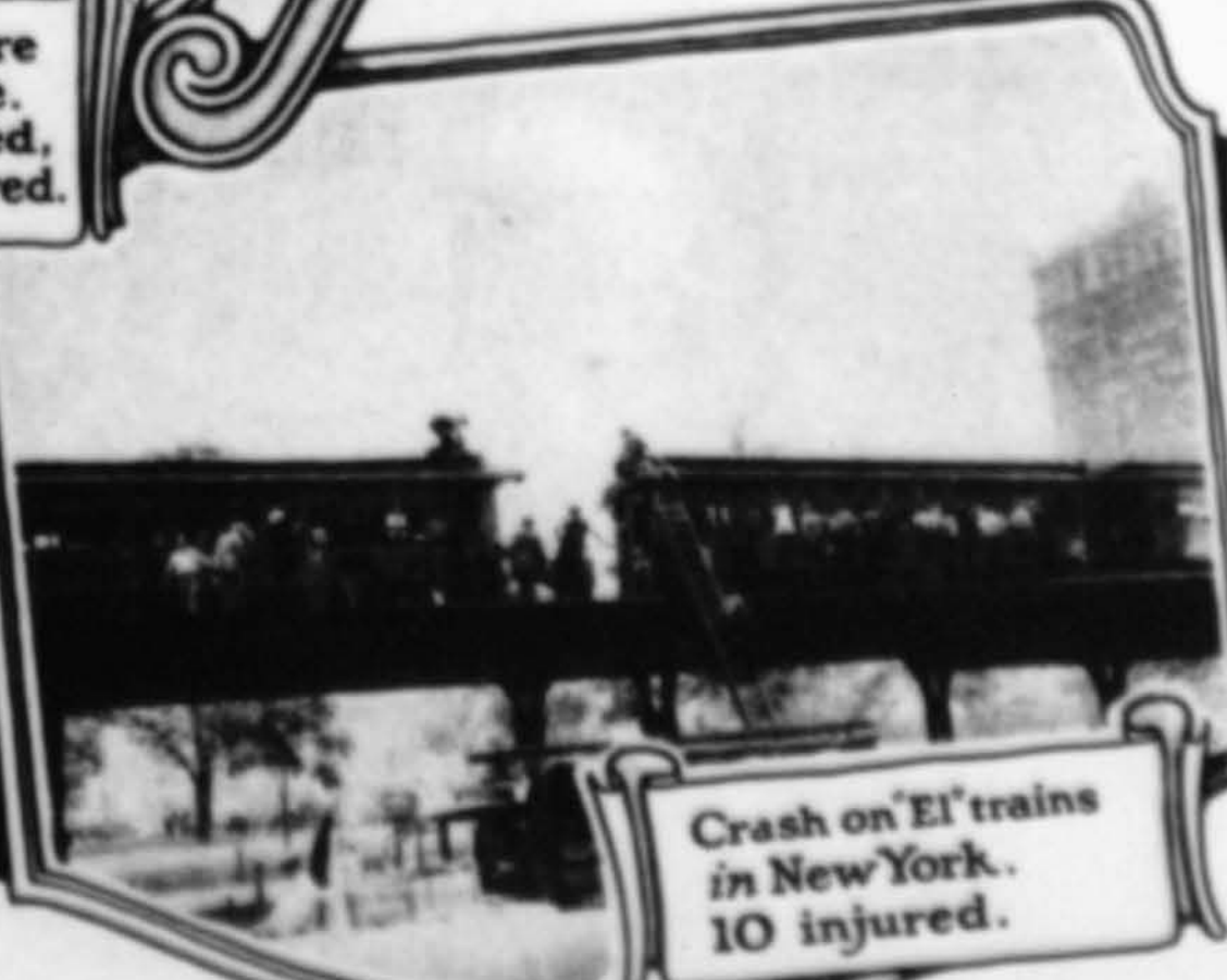
Crash on El trains in New York. 10 injured.