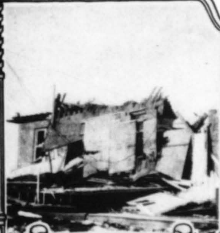
Another stormy wind. 35 killed and hundreds injured in Illinois Tornado.