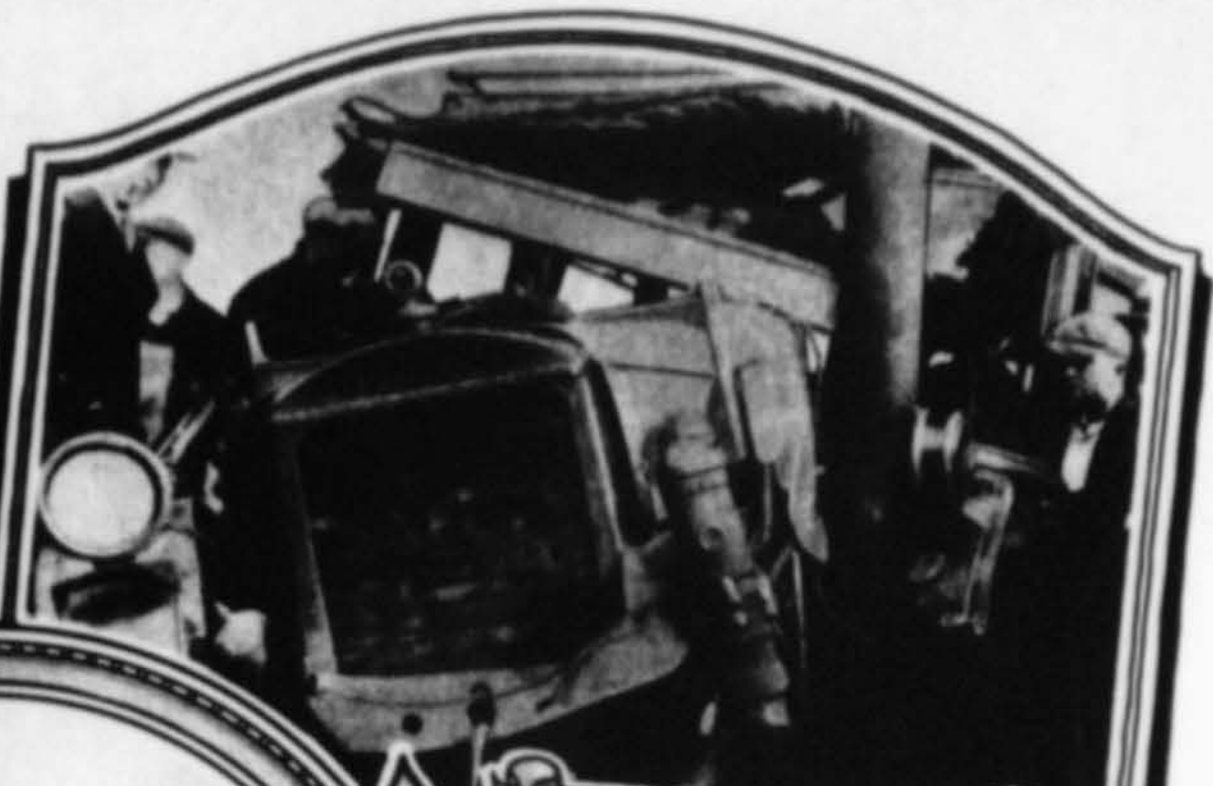
Twenty hurt as bus strikes pole.