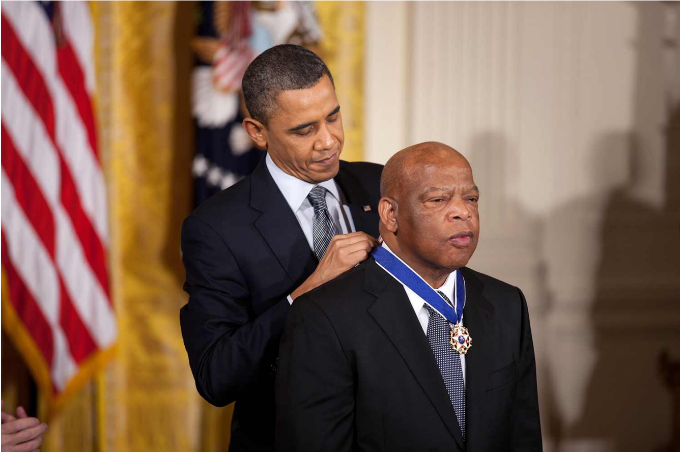
President Barack Obama awards the 2010 Presidential Medal of Freedom to Congressman John Lewis in a ceremony in the East Room of the White House February 15, 2011.