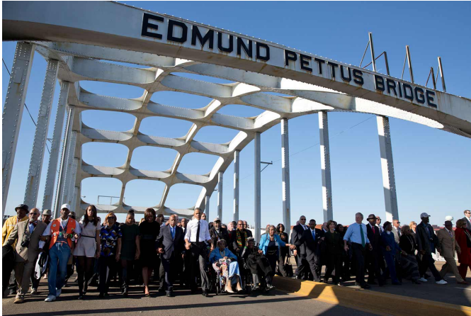
President Barack Obama, First Lady Michelle Obama, daughters Sash and Malia, and Marian Robinson join Rep. John Lewis along with former President George W. Bush and former First Lady Laura Bush on a walk across Edmund Pettus Bridge to commemorate the 50th Anniversary of the “Bloody Sunday” March from Selma to Montgomery on March 7, 2015.

“Given everything that’s happening in our country, I think it’s really important to showcase Lewis’ voice to younger generations...he shows us that it’s okay to go against the grain, to face adversity and to fight injustices when you see them,” she added.