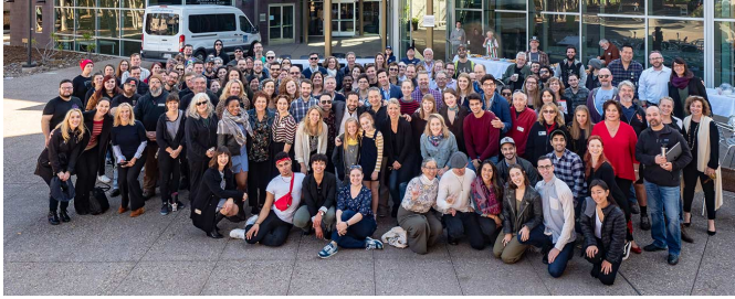
The full “Diana” cast and crew, including five UC San Diego students, outside the Mandel Weiss Theatre on Feb. 9.

The extended production runs through April 7, and features a sweeping contemporary score.