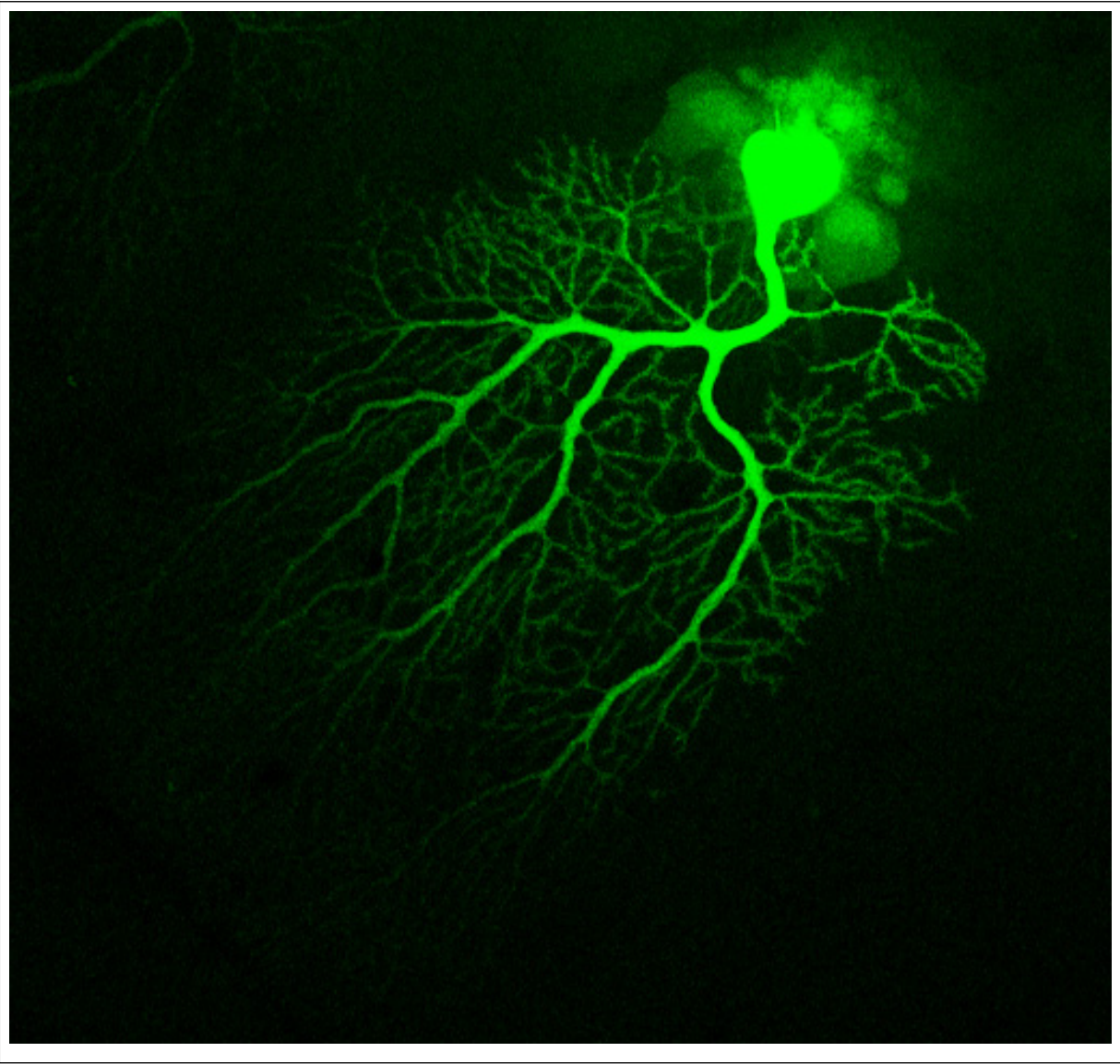
Reconstruction Image -