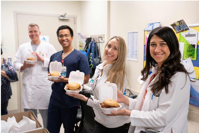
Doctors and nurses take time out to enjoy donated sandwiches from Phil's BBQ and the San Diego Padres.