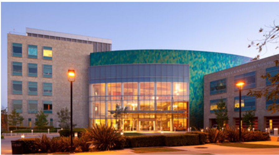
Moores Cancer Center at UC San Diego Health

Participants who are eligible for the Phase I clinical trial must have a diagnosis of neuroblastoma that is verified by pathology or by demonstration of tumor cells in the bone marrow with increased catecholamines – hormones produced by the adrenal glands. Participants must have high-risk disease that is considered either recurrent, refractory or persistent. A special arm of the clinical trial will be opened to evaluate the drug target in especially aggressive cases with alterations in MYCN.