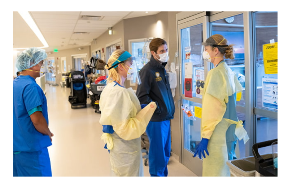
UC San Diego Health clinicians consult outside a COVID-19 patient's ICU room.

As the COVID-19 pandemic continues, there is an urgent need to determine who is at greatest risk for severe disease, better understand how the disease and treatments evolve, and predict the need for resources. But to get there, researchers and clinicians need more data about what patients have experienced so far, and what factors are associated with different patient outcomes.