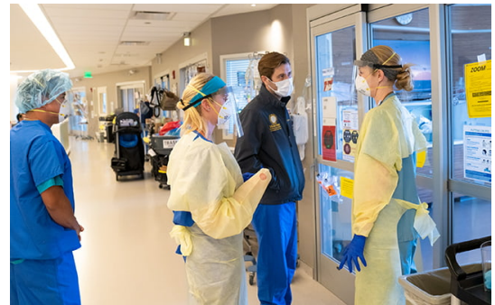
UC San Diego Health clinicians consult outside a COVID-19 patient's ICU room.

As the COVID-19 pandemic continues, there is an urgent need to determine who is at greatest risk for severe disease, better understand how the disease and treatments evolve, and predict the need for resources. But to get there, researchers and clinicians need more data about what patients have experienced so far, and what factors are associated with different patient outcomes.