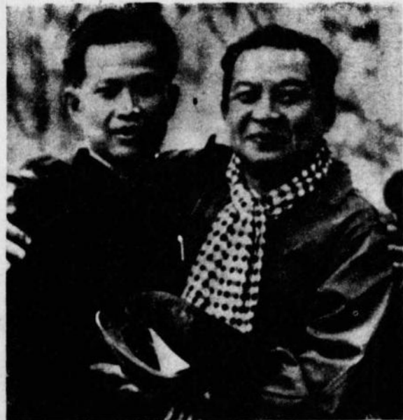
SIHANOUK (RIGHT) & KHIU SAMPHAN

The U.S. has responded to the successes of the liberation forces by launching an all-out propaganda war in this country. But such arguments as national security, the domino theory, and the myth of the "bloodshed" that will follow the takeover by the liberation forces are merely being used to justify U.S. continued presence in the area, and aid to Lon Nol's corrupt dictatorship. The war in Cambodia merely furthers the imperialist aims of the U.S. It is a war being waged by U.S. big businessmen and the U.S. ruling class against the people of Cambodia. It is a war being fought in the name of freedom and democracy but the only freedom involved is the freedom for U.S. corporations and Lon Nol's pup-