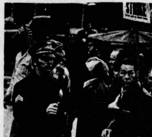
HUELGA EN McDonnell Douglas

Con la agudizacion de la crisis economica en los paises capitalistas los patrones estan utilizando cualquiera tatica para intensificar la explotacion. En las negociaciones de contrato de McDonnald Douglas, la compania le ha ofrecido a los obreros un aumento de sueldo vergonzoso, un aumento de 3% para los proximo tres anos, 10% menos de la presente inflacion. Obreros de la IAM Asociacion Internacional de Maquinistas han rechazado esta oferta y las lineas de piquete de 20,000 obreros siguen solidas. Ningunas sesiones de trato se han llevado acabo y ningunas se han proyectado. Los patrones estan utilizando su vieja tatica de division y conquista para aumentar sus provechos. Han tratado de usar a los obreros de la UAW (Union de Obreros del Auto) como esquiroles, ofreciendoles aumentos de salarios y pago atrasado si ellos ratifican el contrato. Desgraciadamente la UAW ratifico el contrato, pero los obreros de la IAM se mantienen firmes y militantes, rechazando la manipulacion y continuando la huelga a pesar de que mas de 9500 han sido despedidos de su empleo. Tal vez gane unas concesiones la IAM de los patrones pero solamente cuando este sistema cambie sera su explotacion realmente terminada para siempre.