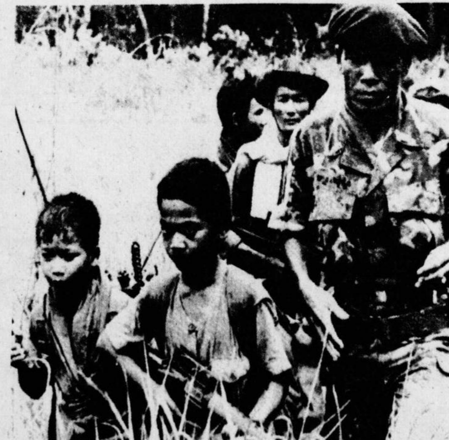
EN SU DESPERACION LA DICTADURA RECLUTA A NIÑOS

Los E.E.U.U. ha respondido a las victorias de las fuerzas de liberación con una campaña de propaganda en este país. El gobierno Norte Americano alega problemas de seguridad nacional, la teoría del dominio, el mito de matanzas y derramamiento de sangre como justificación por su continua presencia en Sudeste Asia. Los E.E.U.U. apoya a la guerra contra la liberación, para mantener sus intereses imperialistas. Es una guerra hecha por las corporaciones y clase soberana en contra de la gente de Camboya. Es una guerra desmembrada en el nombre de libertad y democracia pero la única libertad par la cual pelean los imperialistas, es la libertad de las corporaciones multinacionales y sus títeres Lon-Nol para explotar a la gente de Camboya. La Dictadura esta virtualmente paralizada en toda esfera de servicios publicos. La vida economica de la ciudad esta completamente parada. La gente no apoya al gobierno, hay desordenes en las calles todos los dias. De todos modos el Congreso E.E.U.U. le ha alocado a Lon Nol $220 millones de dolares. Este dinero no va ser para actos humanitarios, como muchos han tratado de decir. Segun especialistas de Pentagon, Lon-Nol gasta 1.5 millones cada dia ($47.5 millones cada año) 87% del cual