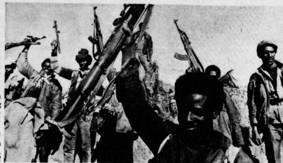
SOLDIERS OF THE ERITREAN LIBERATION FRONT ON TRAINING MANEUVERS

Knowledge of these conditions in Ethiopia leads one to understand the political unrest that now exists in Ethiopia. People are rebelling on all sides. All sectors of society are involved in the struggle. They range from the working class people of the cities to the nomadic people of the border areas, from the peasants to the shopkeepers, from the intellectuals to the soldiers. These were the pressures that overthrew the 50 year monarchy of Haile Selassie, and that will eventually overthrow the military junta that now holds power. The people cannot tolerate the innate injustices of the capitalist system. They are demanding complete and irreversible change, and not the partial reforms that the junta is offering.