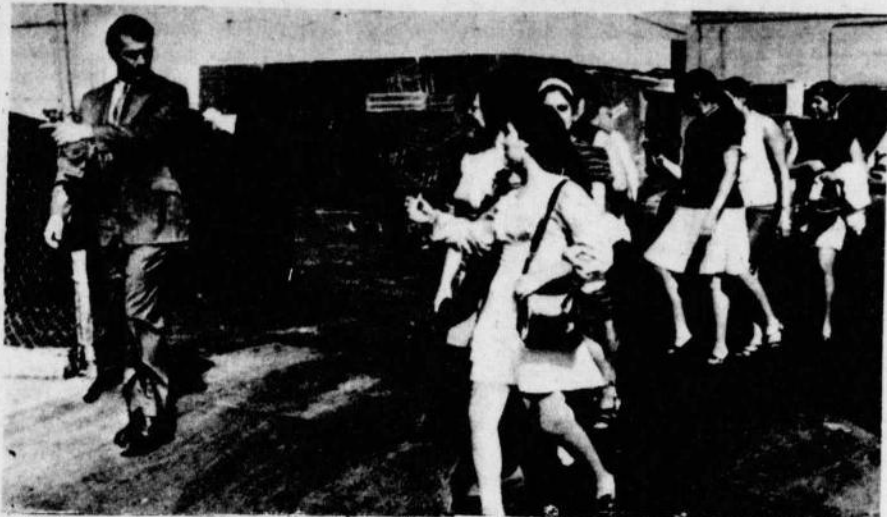
immigrant workers being arrested obreros inmigrantes siendo arrestados