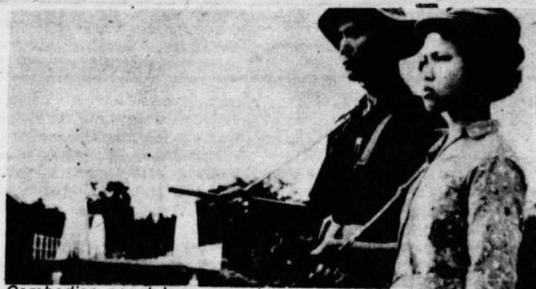
Cambodian people's army cadre stand guard in liberated area.

The U.S. presence in Cambodia is in violation of the Paris Agreement on Vietnam Article 20 (b) signed by the U.S. in Jan., 1973, which states: "Foreign countries shall put an end to all military activities in Cambodia and Laos, totally withdraw from and refrain from reintroducing into these countries, troops, military advisors, and military personnel, armaments, munitions and war materials." The U.S. role in Cambodia has escalated since the CIA-backed coup 5 years ago that ousted Cambodian head of State Sihanouk. The increasing U.S. assumption of control in Phnom Penh, however, will not delay the victory of the Cambodian Liberation Armed Forces. Having virtually no control of the population, Lon Nol has no possibility of replacing battlefield losses. In attempting to find replacements, the dictator Lon Nol has raised the draft age from 50 to 65 and tried to kidnap people in the streets, the factories and the schools to serve in the army. But these efforts have been met with rocks, sticks and heavy resistance. The Khmer