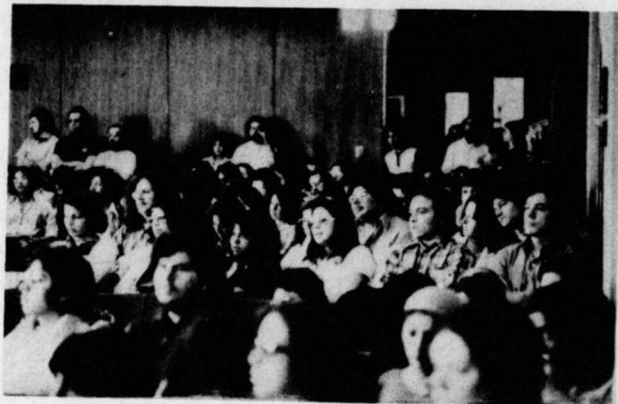
STUDENTS PARTICIPATING IN THE FORUM

Over 500 Latino students attending the student "Conference on Immigration", held at Cal-State L.A. February 22nd & 23rd, resolved to support C.A.S.A.'s national campaign of solidarity with the immigrant worker and the mass mobilization on May 3rd commemorating International Worker's Day and the Battle of the 5 de Mayo.