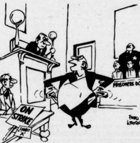
... and then the accused conspirators were observed signalling to each other, like this...

The Peoples Republic of China has a new constitution. It was ratified January 17 by the Fourth National Peoples Congress in Peking attended by 2864 delegates, 72% of whom were either workers, peasants, or soldiers. The constitution is the result of five years of discussion and reflects the changes that have taken place in China since the first constitution of 1954. The three major changes have been the formation of people's communes, the campaign to build a socialist economy, and the Great Proletarian Cultural Revolution of the past eight years. The main difference that has taken place in China is that a socialist economy and society, which was still a goal in 1954 has, by the hard work of the people, been made a reality. The constitution stressed that socialist countries must always struggle to preserve socialism, because there are always selfish people who want to restore capitalism and advance their interests above the interests of the rest of the people.