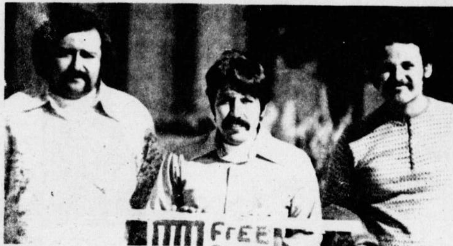
LOS TRES ENCARCELADOS pagina 4

SOLIDARIDAD CON EL TRABAJADOR INMIGRANTE pagina 3 SOLIDARITY WITH IMMIGRANT WORKER page 3