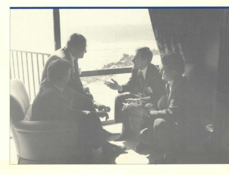
Wednesday and Thursday, February 12 and 13, 1992 Hotel del Coronado, Coronado, California

Your Invitation to the Eighth Annual San Diego Technology Financial Forum