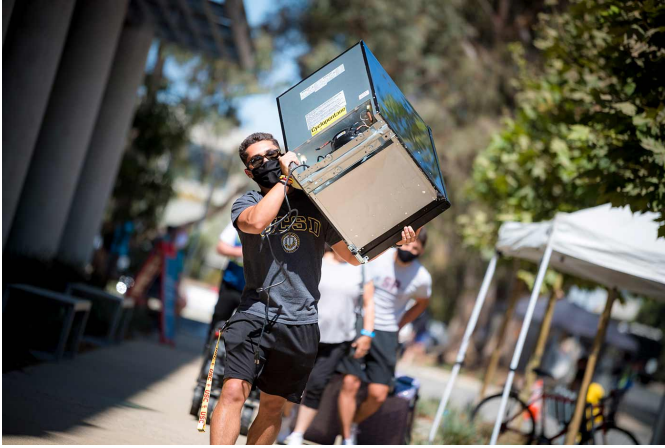
Students on campus have been masking, following public health guidelines and making sacrifices to keep themselves and our community safe.

For every person who adds and uses the notification system on their smartphone, the greater the possibility of quick detection. Thus far, an estimated 11,000 people at UC San Diego have added the notification system, which augments existing contact tracing efforts on campus. This voluntary program is the first pilot for the State of California, and will be followed by UC San Francisco. If the pilot is successful, it will set the foundation for the state to offer voluntary exposure notifications to all Californians using smartphone-based technology. By some estimates, for every two users of the