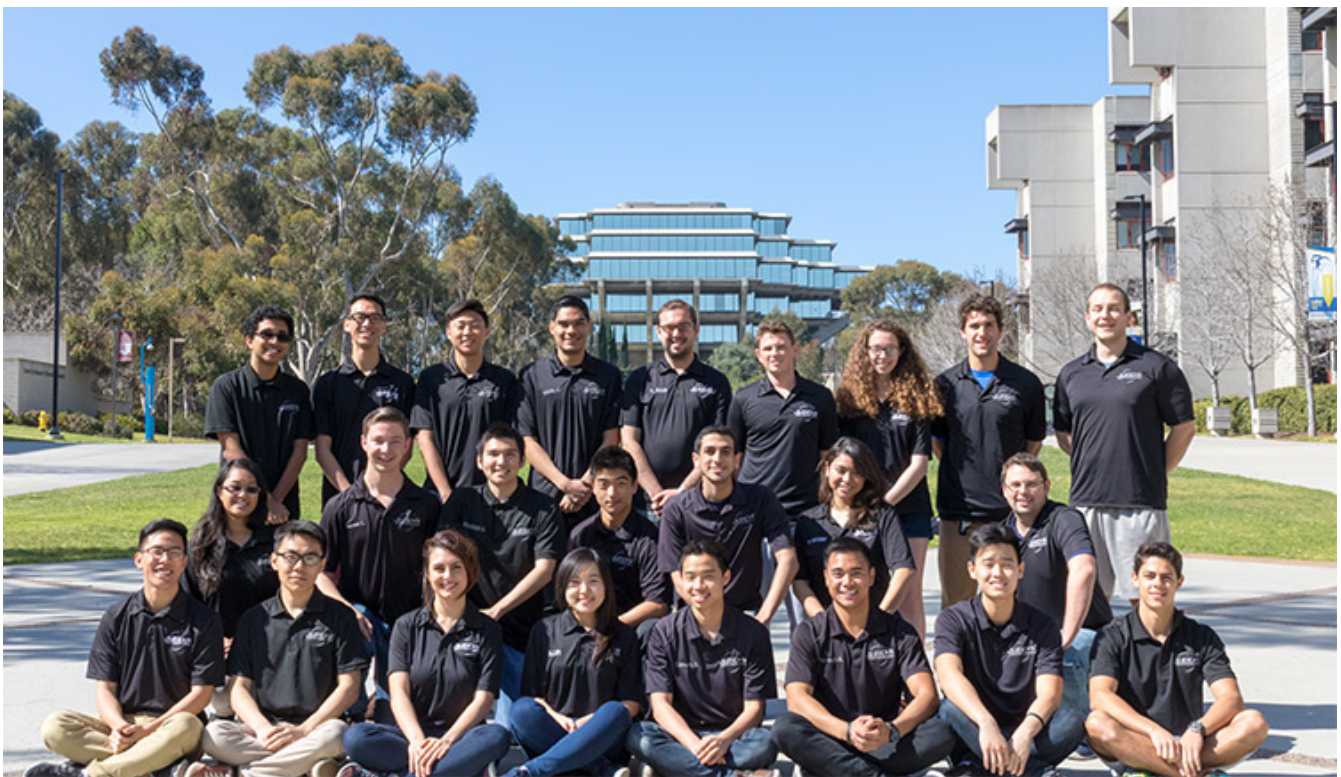
The Students for the Exploration and Development of Space (SEDS) Cubesat Team at the University of California San Diego.

A team of engineering undergraduates at UC San Diego is one step closer to sending a satellite into orbit around the moon after placing third in a NASA satellite design competition. The win comes with a $30,000 award and gives their design a good shot at a spot aboard NASA's Orion capsule as part of its first unmanned lunar flyby, planned for 2018.