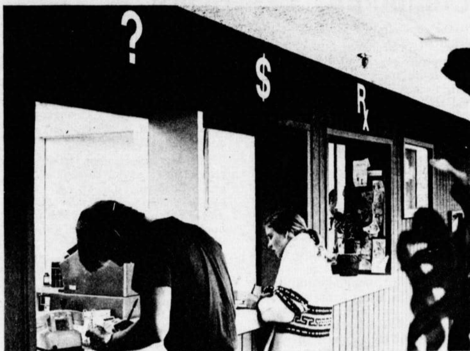
UCSD Health Coverage: Rx plus $ equals ?