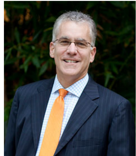
To. ML Sa He Sy.