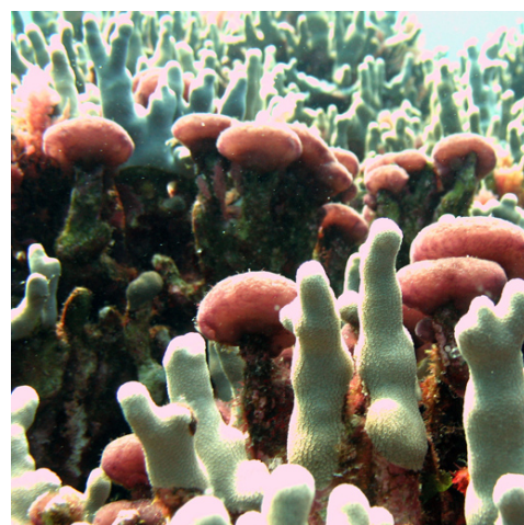
Cyanobacteria (dark shades) found in Hawaii produce chemical compounds with biomedical potential.

Specifically, the substances hamper bacteria's ability to "swarm" over surfaces. For example, when overtaking a new area, bacteria secrete small amounts of a substance known as a quorum sensing factor, which tests to see if the new surface is safe for colonization. Halting a quorum sensing factor could one day translate to a treatment