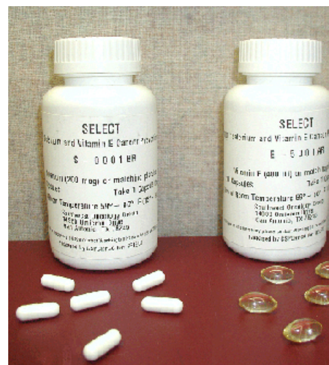
Vitamin E Supplements

The SELECT study – which began in 2001 – included more than 35,000 men. Earlier research suggested that selenium or vitamin E might reduce the risk of developing prostate cancer. Participants were randomly assigned to take one of four sets of supplements or placebos: one group took both selenium and vitamin E; one took selenium and a placebo that looked similar to vitamin E; one took vitamin E and a placebo that looked similar to selenium; and the final group received placebos of both supplements. Men who took selenium alone or vitamin E and selenium together were also more likely to develop prostate cancer than men who took a placebo, but those increases were small and possibly due to chance.