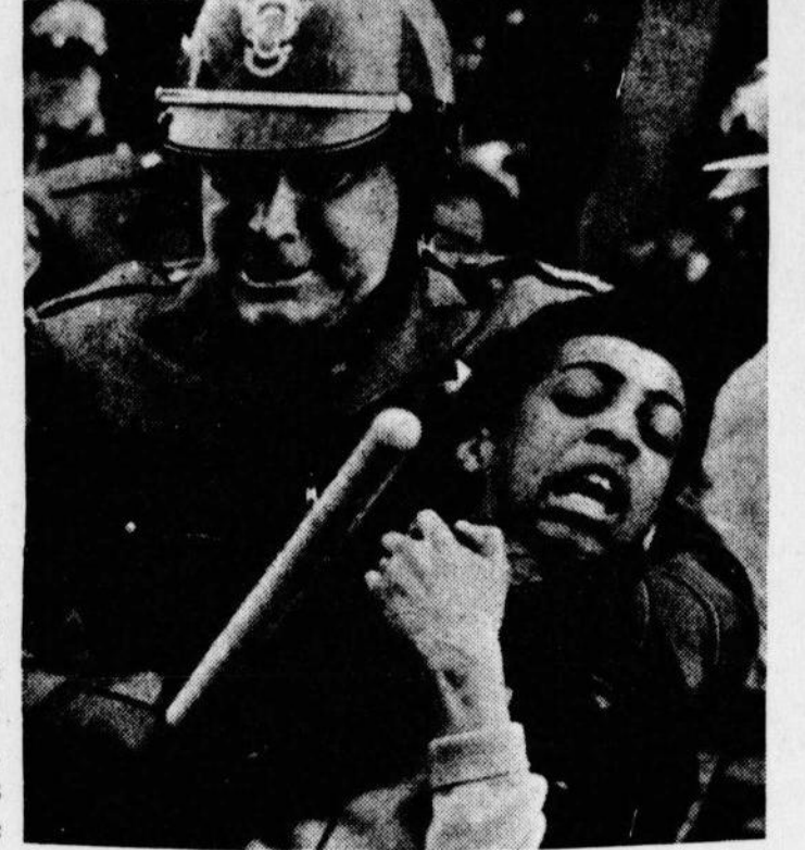
This scene is indicative of the police actions at the Miami riots.

An all white jury heard but with a sequence of home from school early center for counseling or shot 21 year old Black