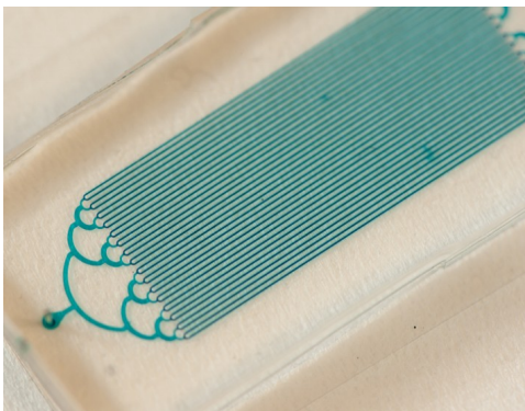
c device containing an array of "biopixels" (square high bacteria grow.