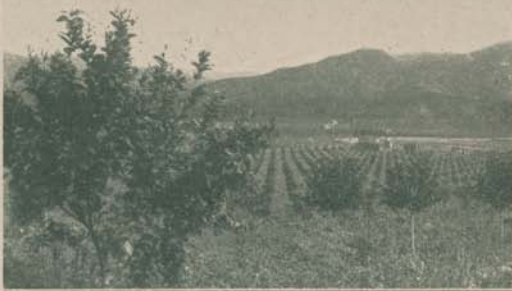
Young Citrus and Avocado Grove