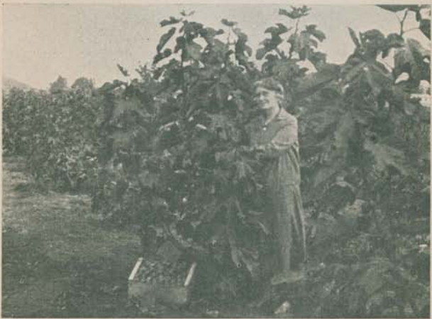
A Clarkadota Fig Orchard

There is no better supply of water in California than that furnished by the Vista Irrigation District from Lake Henshaw. An abundant supply of pure mountain water from Palomar mountain. Pure drinking water and ample for all irrigation needs. Along the lower parts of the valleys, wells at a shallow depth furnish an abundance of water for both domestic and irrigation use.