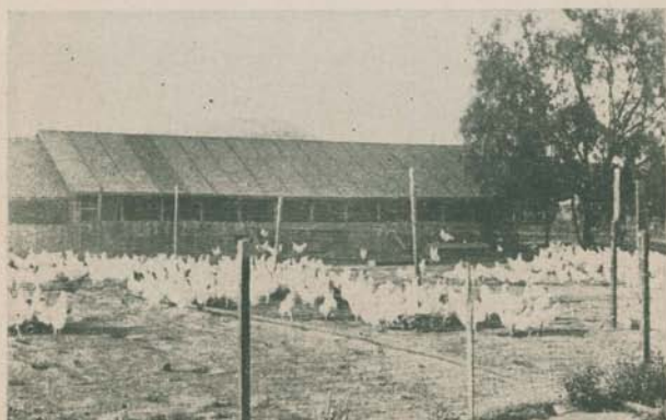
One of Many Poultry Ranches in the Valley

As a citrus country we recognize no competition. Our oranges, containing a higher sugar content, are possessed of a richness of flavor and delicacy of texture unequalled. A ride through the citrus groves, laden with golden pendants is pleasing to the eye, and inspiring to those who would farm with pleasure as well as profit. Lemons and grapefruit grow in similar abundance and with the same rich flavor imparted by 350 sunny days in each year. Limes, now becoming one of America's most popular thirst quenching drinks, are grown here with a pungent flavor that has created a good demand for them.