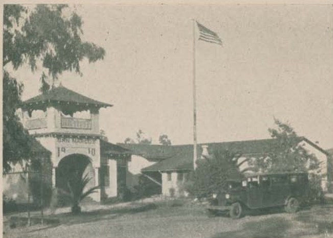
San Marcos School