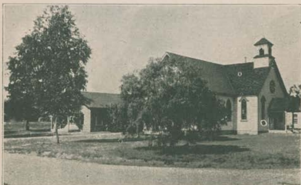
San Marcos Community Church

Flowers and bulbs have developed into an important industry. Since the advent of irrigation water, Christmas gladioli, narcissi, hyacinths, ranunculi and dahlias go forth in profusion. The bulb industry has now become a fixed industry.