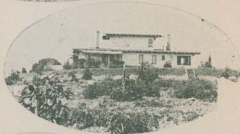
SCENES IN THE SAN MARCOS AND TWIN OAKS VALLEYS