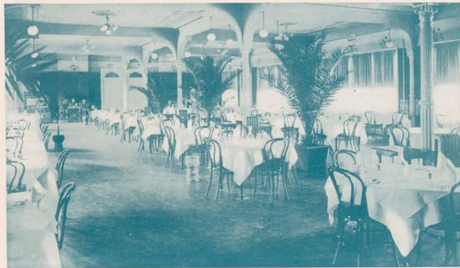
Dining-Room, "Hotel Robinson"