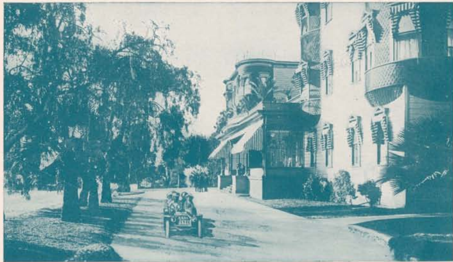
East Entrance, "Hotel Robinson"