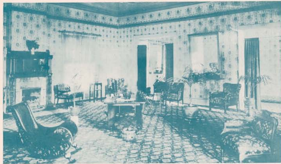
Ladies' Parlor, "Hotel Robinson"