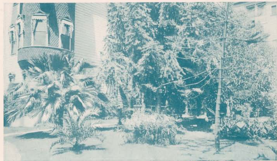
The Beautiful Open Court, 125x200. The splendid shrubs and trees and tropical plants make it one of San Diego's beauty spots.