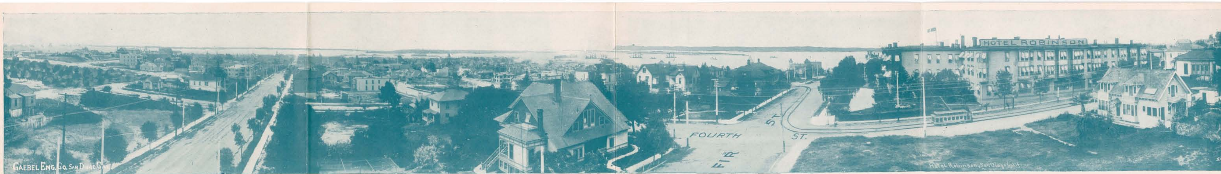
Panoramic View of San Diego with the Hotel Robinson—San Diego is a City of 50,000 population, with the most even climate in the world: an unlimited supply of pure mountain water, the cheapest in the state. 446 miles of boulevard being constructed in the county costing $1,250,000. Rails now being laid on the San Diego and Arizona Railroad. With the completion of the Panama Canal, Uncle Sam's coaling station and other contemplated improvements and the World's Fair in 1915 conservative estimates San Diego's population will reach 200,000.