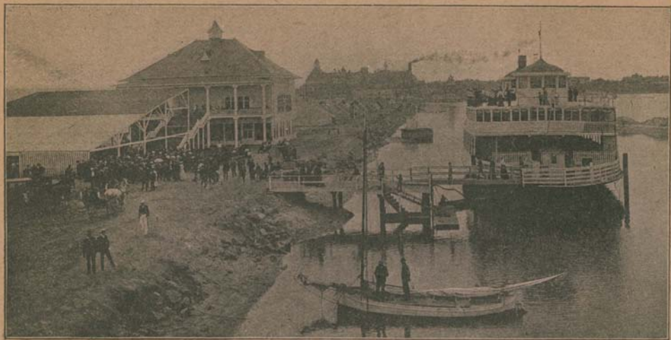
FLOATING CASINO AT TENT CITY