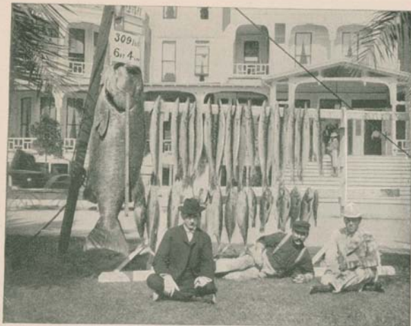
A MORNING'S CATCH