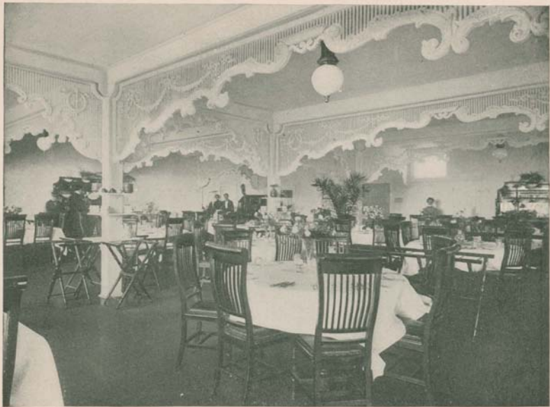
T H E T E N T C I T Y C A F E