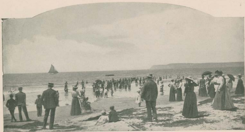
SURF BATHING AT TENT CITY