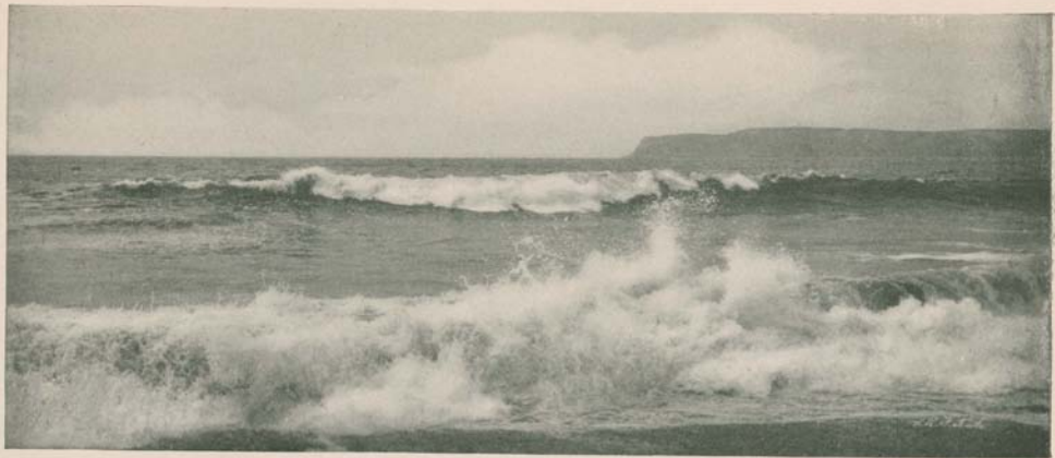
A SURF SCENE