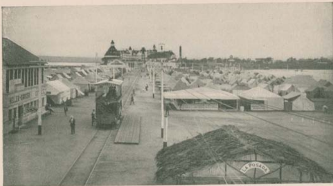
THE TENT CITY

a water supply with hydrants at each tent; also a complete sewer system, which with the completeness with which the garbage is daily disposed of, makes the sanitary conditions the most perfect imaginable.