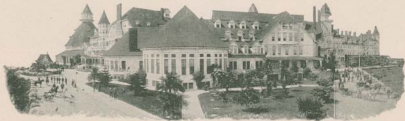
HOTEL DEL CORONADO

There are steam yachts, tallyhos, automobiles, carriages, street car and railroads, or you can take a horse back ride to any of the places mentioned. If you are fond of cycling, bring your bike with you, as the excellent roads and cycle paths of this section makes every place of interest easily accessible.