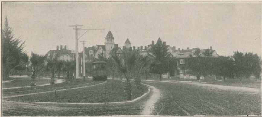
ORANGE AVENUE, APPROACHING TENT CITY