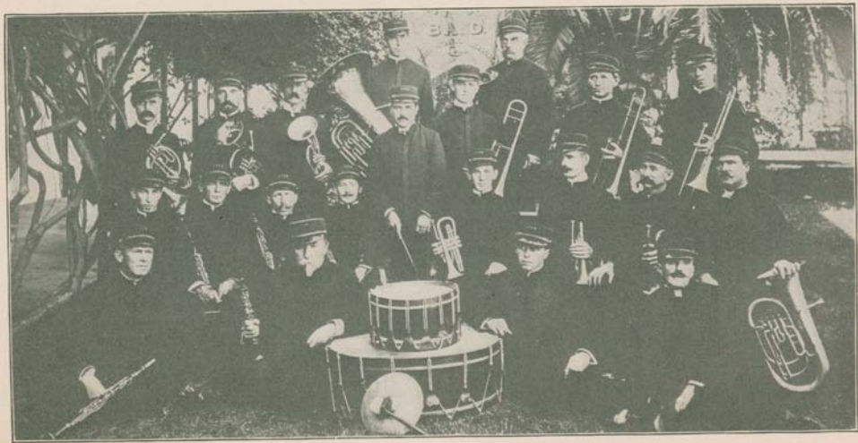
TENT CITY CONCERT BAND