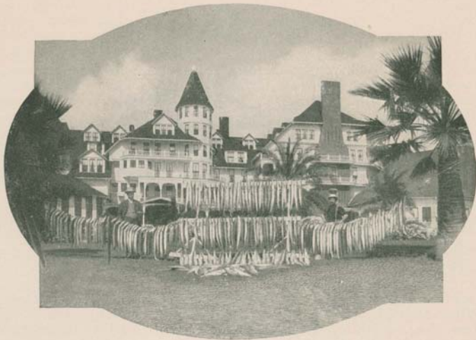
CAUGHT THE WHOLE SCHOOL

These are the daylight outings from the camp, but if you prefer, you can stay at the camp and amuse yourself at the bowling alley, the merry-go-round, the afternoon musicale; or you can spend your time at the library.