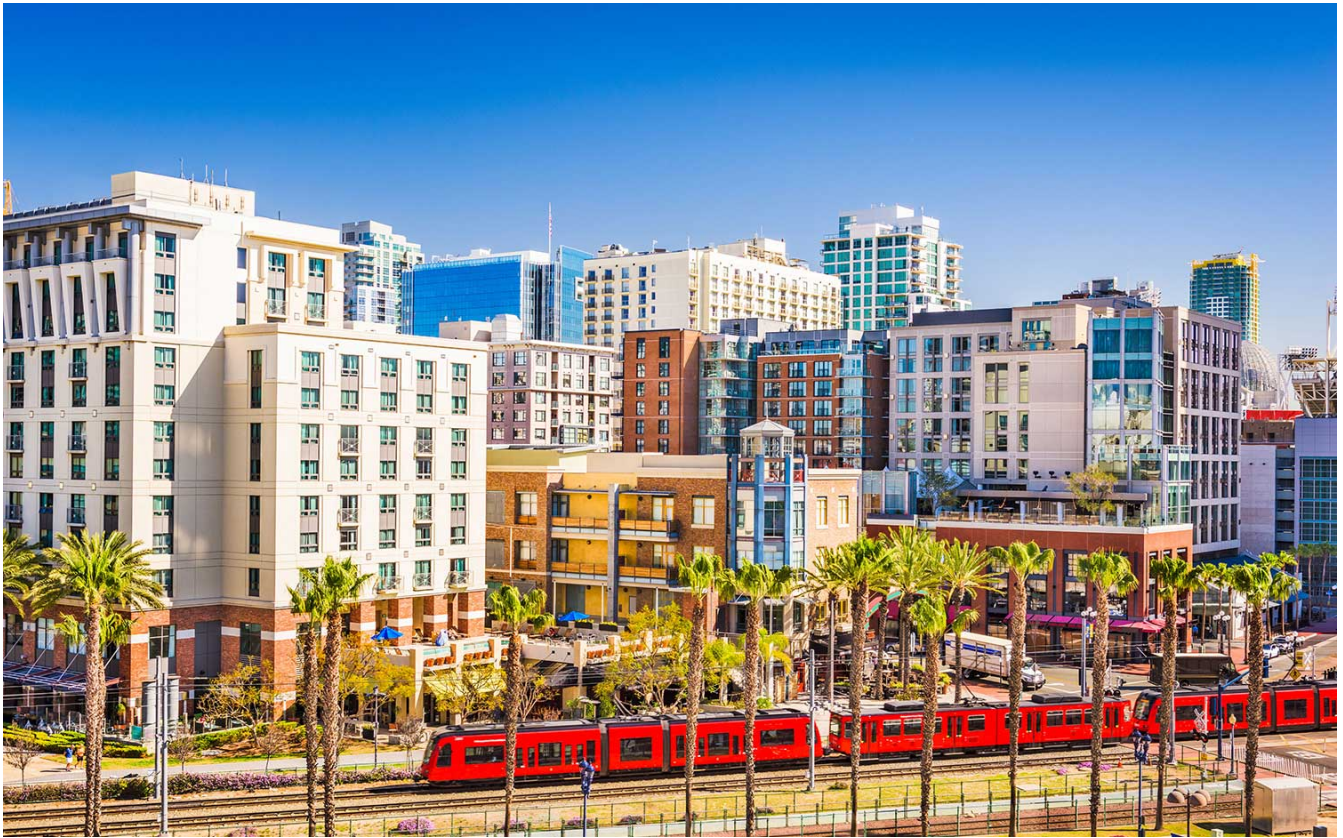
San Diego, California cityscape stock photo.