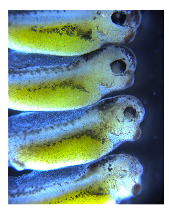
A bright field image displays two-day old tadpoles studied with a fluorescent inhibitor of gene expression (white color beneath the eye in the bottom two tadpoles).

The researchers discovered that this change is rooted in a process known as "neurotransmitter switching," an area of brain research pioneered by Spitzer and further investigated by Dulcis in the context of psychostimulants and the diseased brain. The dopamine neurotransmitter was found in high levels during normal family kinship bonding, but switched to the GABA neurotransmitter in the case of artificial odor kinship, or "non-kin" attraction.