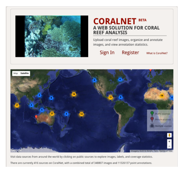
A screenshot of the CoralNet website.

CoralNet Beta cuts down the time needed to go through a typical 1200-image diver survey of the ocean's floor from 10 weeks to just one week—with