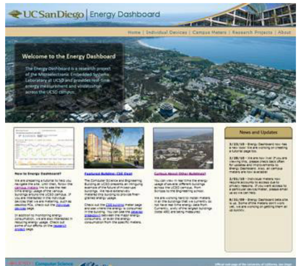
Home page of the UC San Diego Energy Dashboard, which will be used as a test case for the new database techniques to be developed by the Plato project.

The Plato system will allow analysts to develop quickly declarative queries that can be automatically optimized. "By doing so, the project will deliver the envisioned productivity gains," says Papakonstantinou. "Plato will also lower the technical sophistication required of users, therefore enabling many scientists and domain specialists to work with sensor-data analytics." While Papakonstantinou focuses on designing a model-aware data model and query