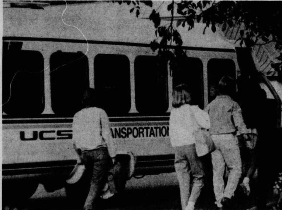
LUCKY STUDENTS fortunate enough to get a space on the Shuttle file in.

"There are three buses, but there's always one needing to be repaired. If we were to get students used to a third bus, then take one away to repair it, they'd be