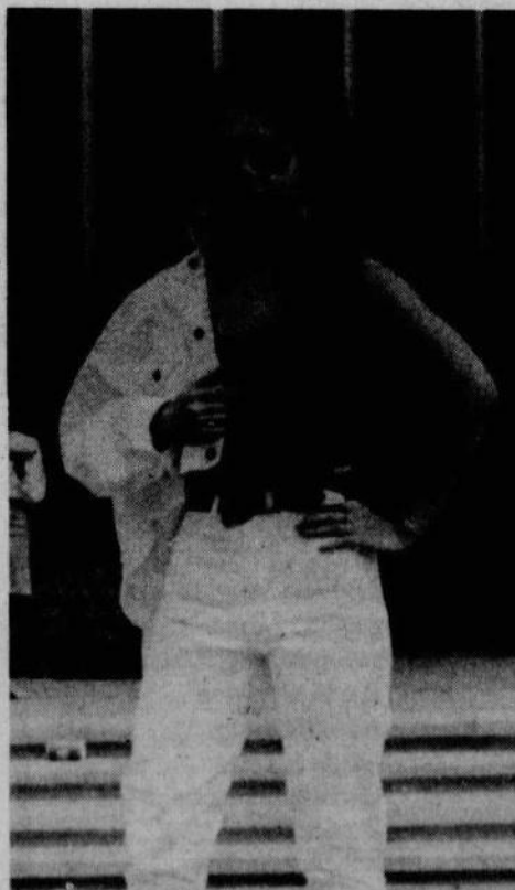
MODELING SPRING FASHIONS--Students display the latest in Spring fashions during the Fashion Show on the Plaza, March 4.