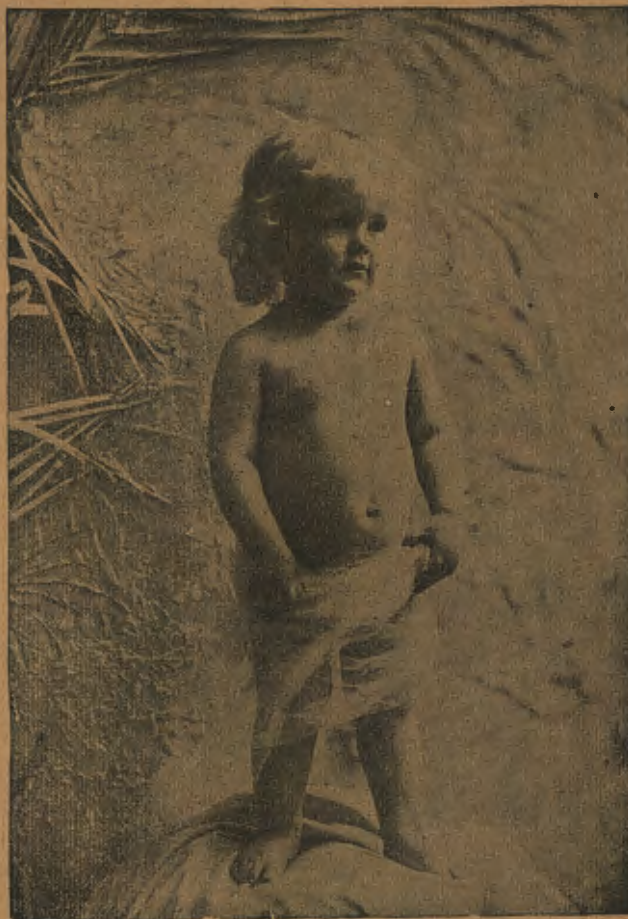
GROWN IN IMPERIAL VALLEY