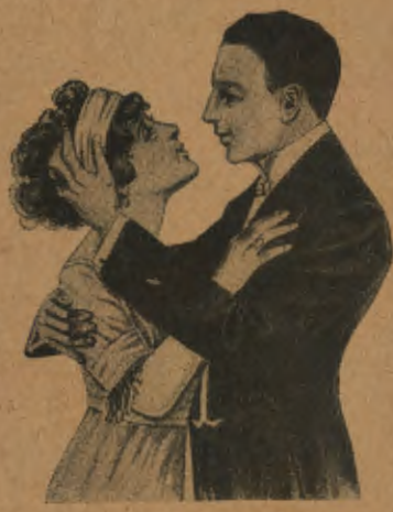
Gee, But it's Nice