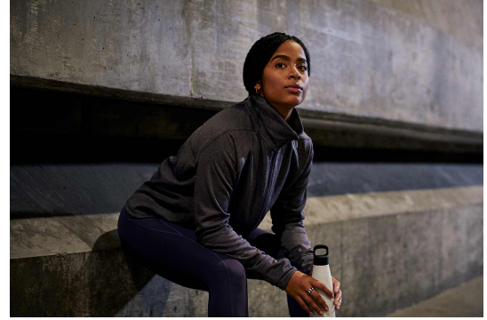
An image provided by Oura, showing someone wearing one of the rings the company makes.

Ultimately, said Smarr, the researchers hope to use the data to predict the virus’ spread and set up an early alert system.