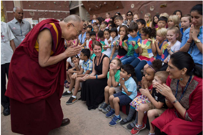
His Holiness meeting with K-12 students