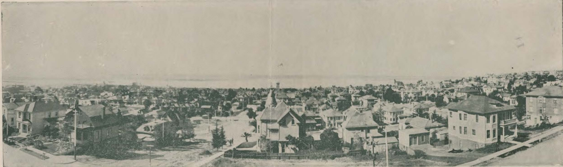
San Diego City and Bay, from Florence Heights.