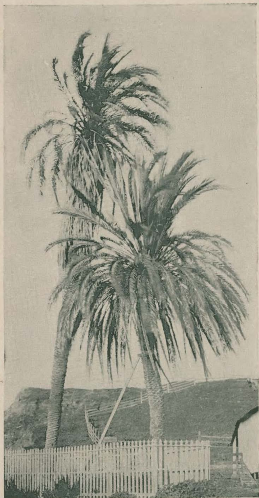
Mission Palms, Old Town. (Planted by Father Junipero Serra, 1769.)