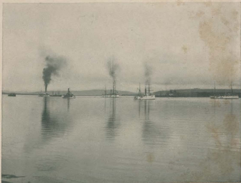
Pacific Squadron in San Diego Bay.