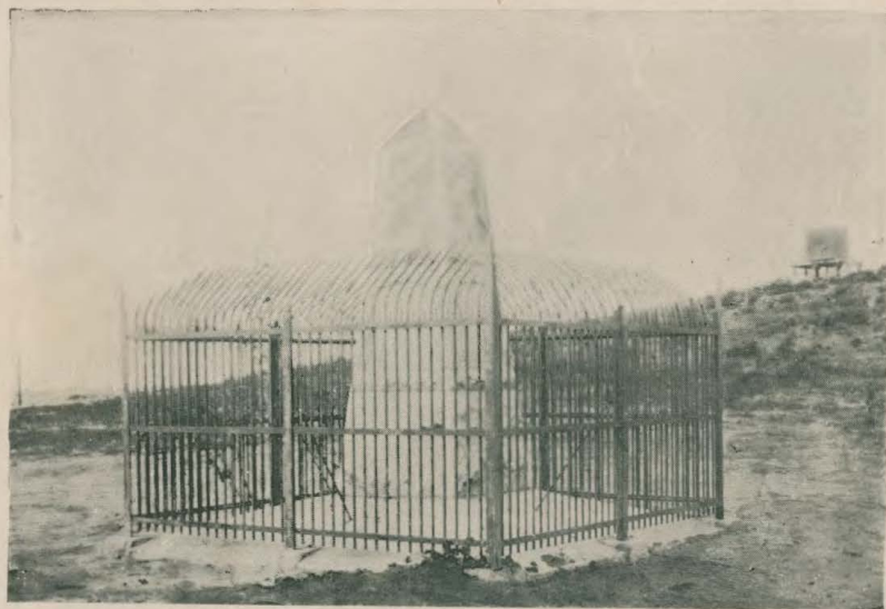
International Boundary Monument, Tia Juana.