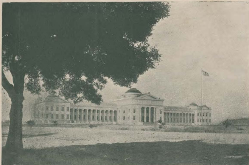
State Normal School, University Heights.