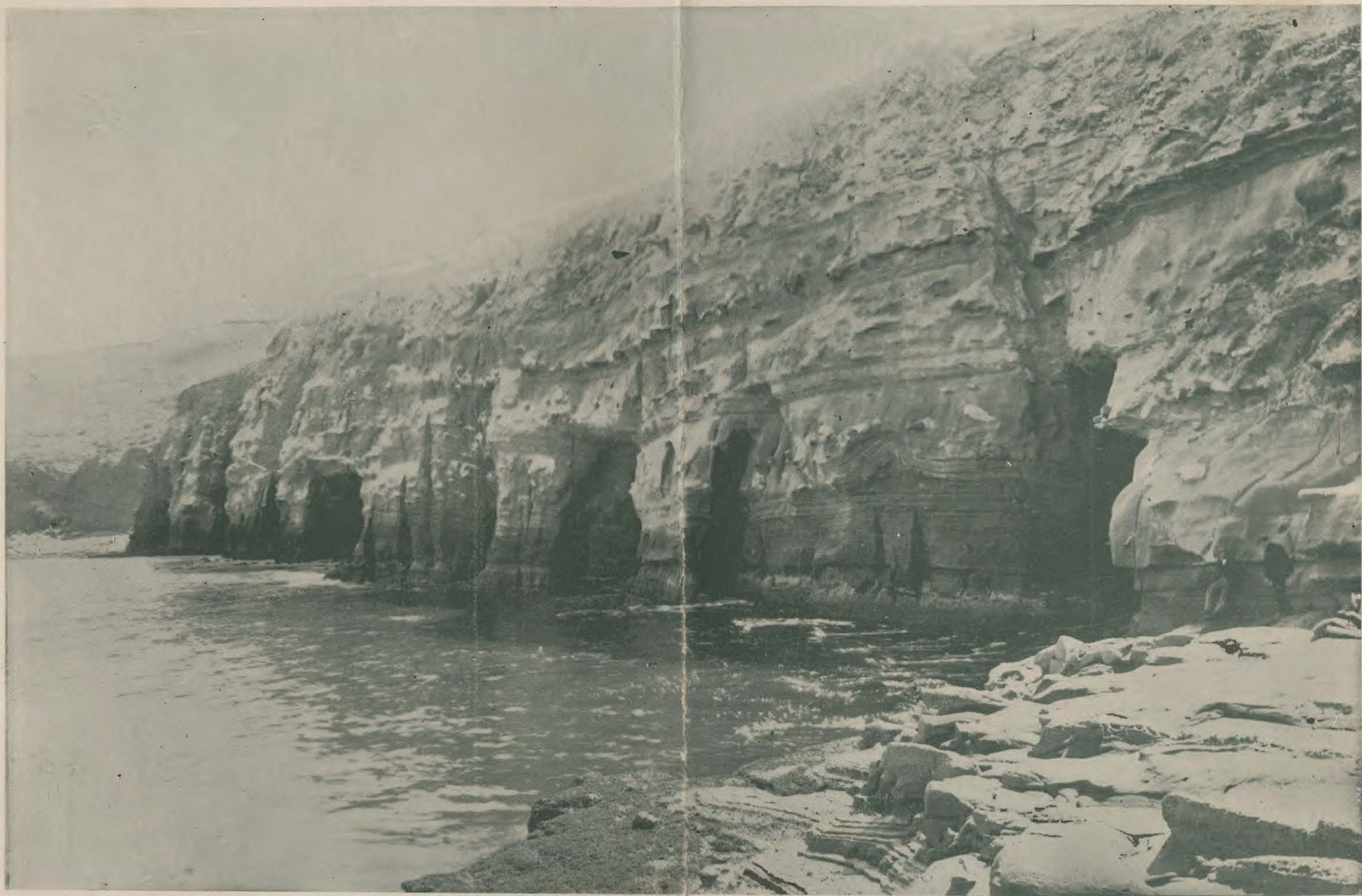
The Caves, La Jolla.