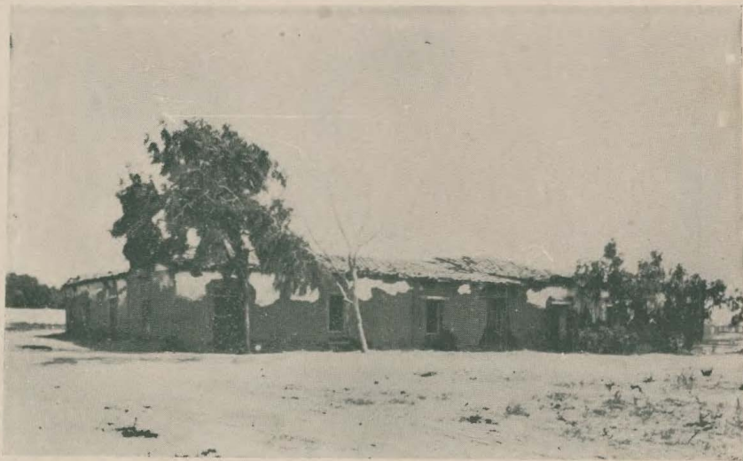
Ramona's Marriage Place, Old Town.