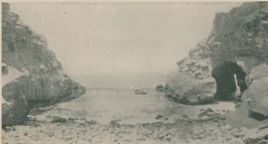
Emerald Cove, La Jolla.