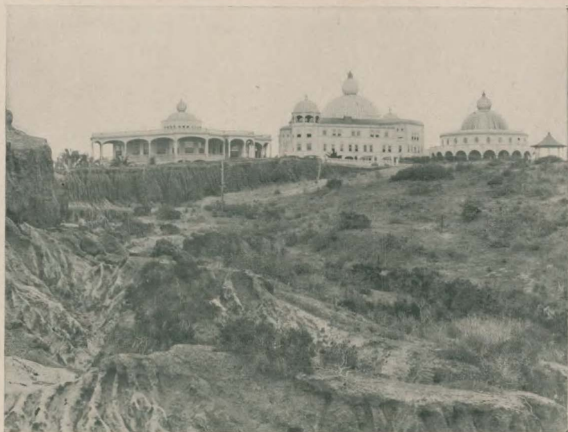
Point Loma Homestead, Theosophical Headquarters.