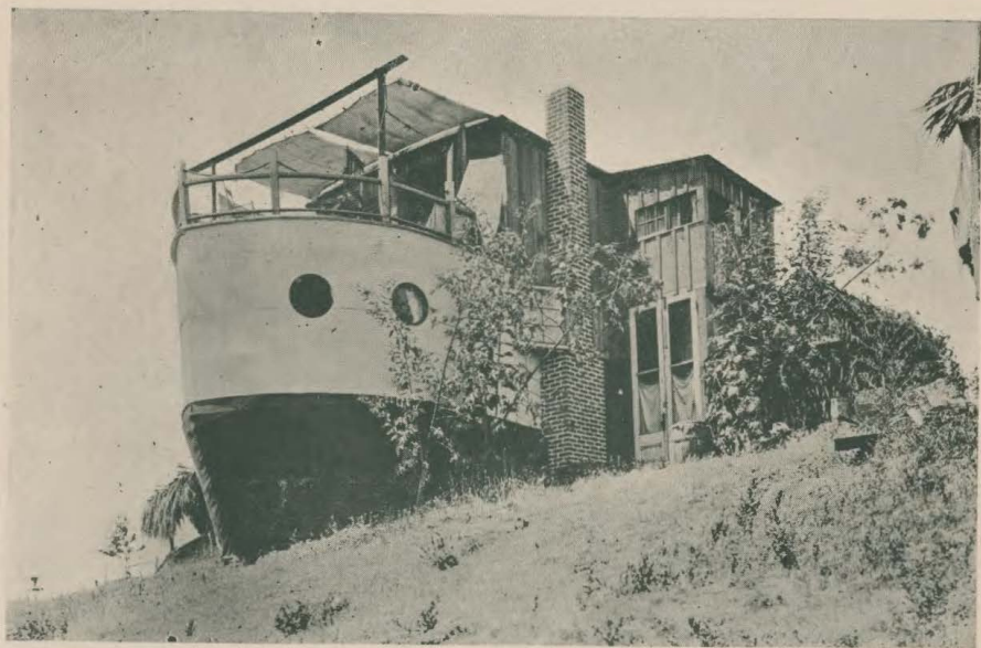
Anna Held's Ark, La Jolla.