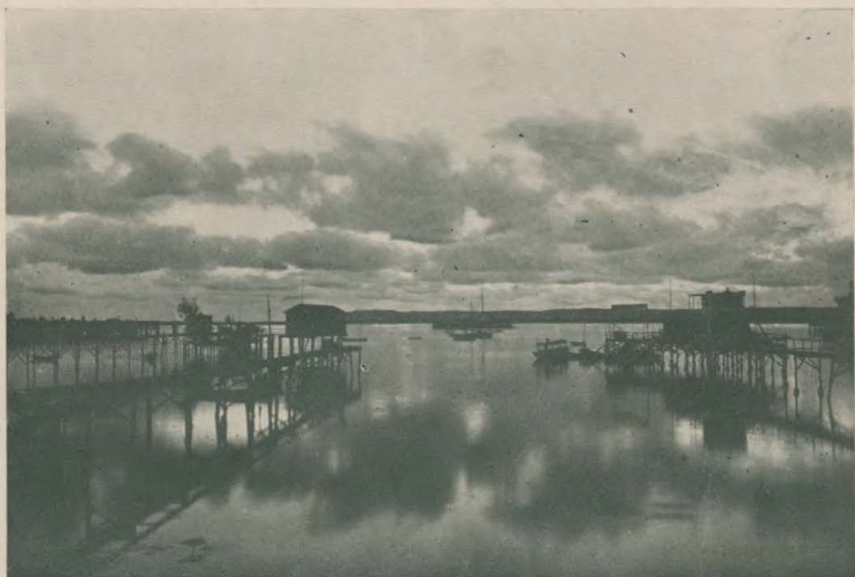
Sunset, San Diego Bay.