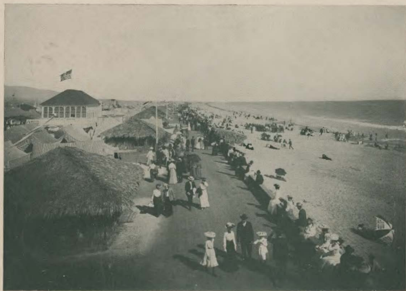
Palm Cottages, Coronado Tent City.