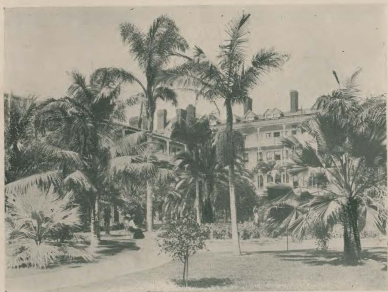
Palm Court, Hotel del Coronado.