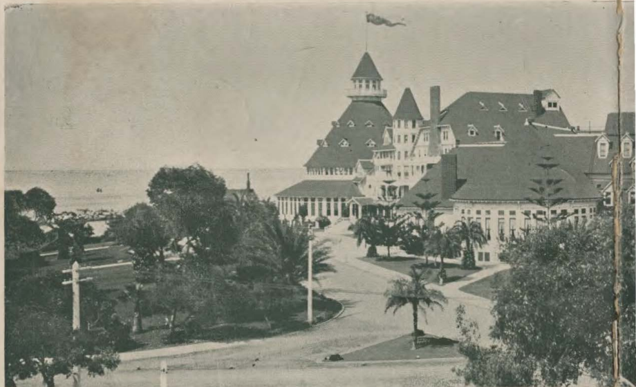
Hotel del Coro