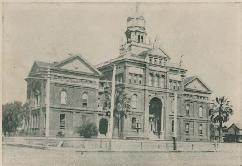
County Court House.