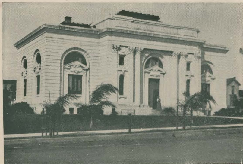
Carnegie Public Library.