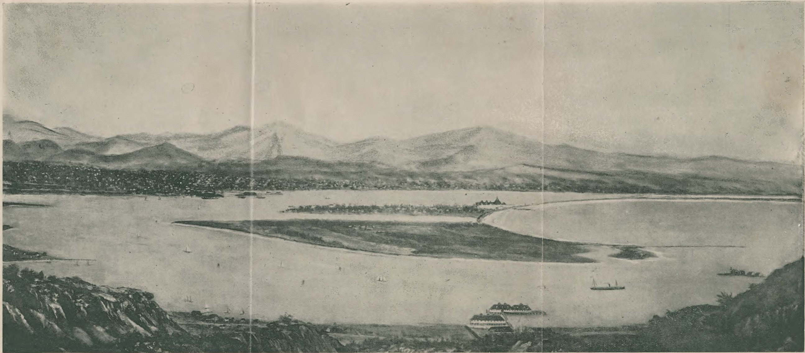
San Diego Bay, from Point Loma. ("After Naples, the most magnificent Prospect in the World"—Charles Dudley Warner.) (Copied from Oil Painting.)