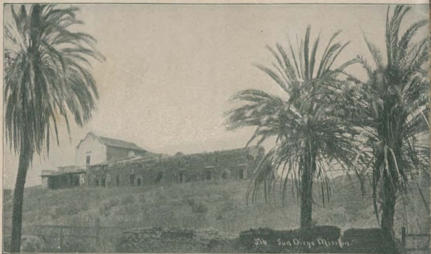
San Diego Mission. (Founded by Father Junipero Serra, 1769.)