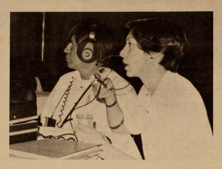
SIMULTANEOUS BI-LINGUAL TRANSLATION WAS PROVIDED FOR CONVOCATION PARTICIPANTS FROM MEXICO