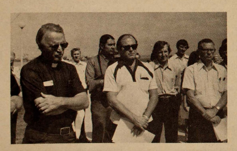
PARTICIPANTS GATHERED AT U.S.-MEXICAN BORDER PARK FOR PRAYER SERVICE

The results were a historical ecumenical convocation in which representatives from the Roman Catholic, Lutheran, Presbyterian, American Baptist, Quaker, Episcopalian and Methodist churches gathered in San Diego to prepare "action steps" that would ensure the start of an ecumenical ministerial network and ecumenical communications clearing house devoted to serve the rights of the Undocumented workers in the U.S. This ministerial network will expand during the coming year as other conferences planned on the subject of the undocumented are contacted and the network and resources of the San Diego convocation—especially the ecumenical communications clearinghouse—are shared.