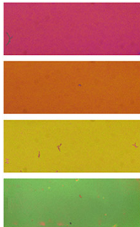
Scanning electron micrographs of films made from nanoparticles of polydopamine seen in cross section. The top film produced a red hue, the bottom green.

Natural melanosomes found in bird feathers vary in size and particularly shape, forming rods and spheres that can be solid or hollow. The next step is to vary the shapes of nanoparticles of polydopamine to mimic that variety to experimentally test how size and shape influence the particle’s interactions with light, and therefore the color of the material. Ultimately, the team hopes to generate a palette of biocompatible, structural color.