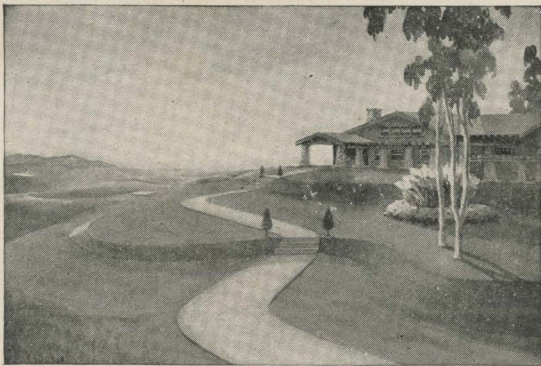
VIRGINIA COUNTRY CLUB With Good Golf Course

Direct connection with Pasadena, Riverside, Mt. Lowe, San Pedro Harbor, Government Breakwater, Catalina Island and all points of interest. Miles of fine automobile roads. A magnificent stretch of firm ocean beach, easy to walk or ride on. In addition, Long Beach has many other attractions not found elsewhere.