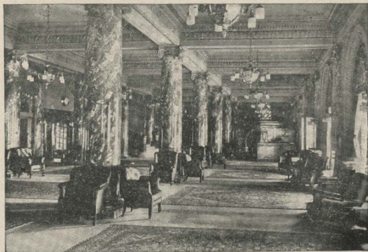
VIRGINIA LOBBY With its Beautiful Marble Columns