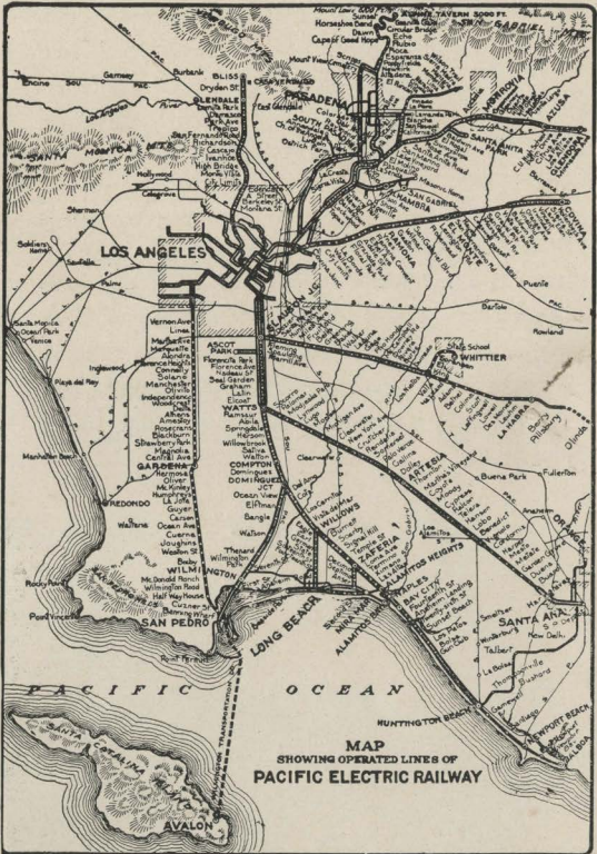
Map showing location of Hotel Virginia, Long Beach, Southern California and connecting Electric Railway lines.