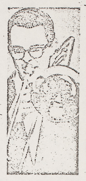
STUART DEMPSTER Musical and rambunctious

College. It's cheaper than rockets and lots more fun.