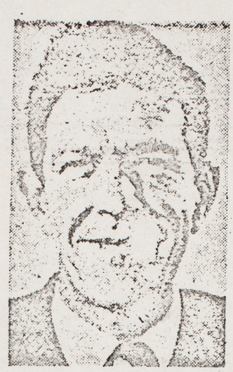
JOHN CAGE A very funny man

Andy Warhol's decor of helium-inflated large aluminum pillow was quite mar-