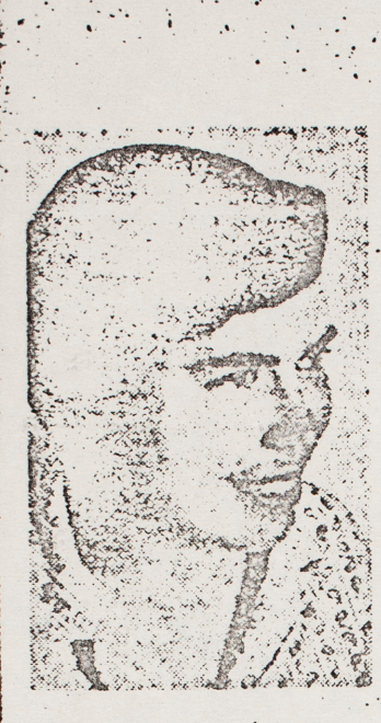
PAULINE OLIVEROS Masterful translation